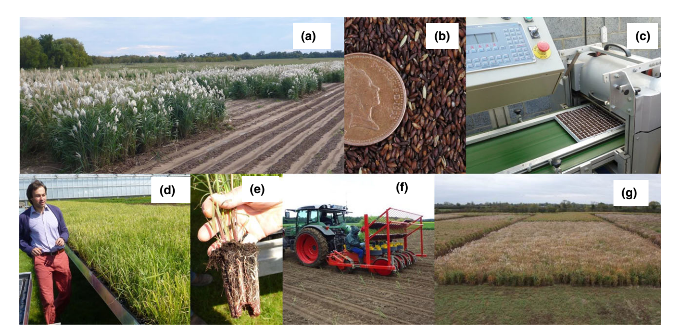
Fig. 1 Steps taken to develop seed-based Miscanthus hybrids: (a) Field seed production trials in CERES, USA. (b) Threshed Miscanthus sinensis seed with a British pound coin for scale. (c) High throughput plug sowing. (d) Dr. Michal Mos, checking plugs which are hardening for field planting in Lincoln. (e) A field-ready plug. (f) Mechanical planting of plugs with a Unitrium plug planter in Stuttgart, Germany. (g) Large-scale replicated 0.25 ha plot trials in Lincoln, UK.

The chances of seedling establishment in the temperate zones can be improved by covering the seed bed after sowing with photodegradable transparent polymer mulch films, as is used for maize (Keane et al. , 2003). These film coverings create conditions conducive to