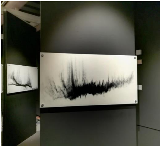
Figure 1. Haecceity by Tracy Hill at Warrington Museum (Hill, 2018)

These examples highlight the merge of printmaking with digital and analogue technologies, whilst changing the way in which people view, share and engage with printed artwork.