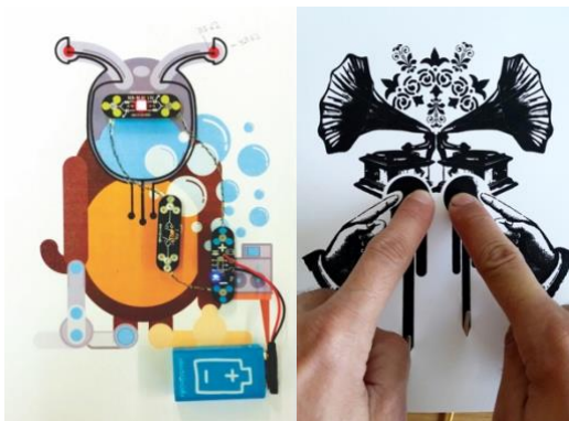
Figure 3. (Left) Silver ink and conductive thread can power a series of LEDs. (Right) Screenprinted carbon Ink on paper reacts well when activated by touch

For our experiments we tested the conductivity of the materials by using a multimeter, a device used for measuring voltage, current and resistance. The values that we tested were the resistance levels as seen in Figure 5. This is measured in ohm, which will depend on the used material, as well as size and shape of the object. For example, thin carbon based screenprinted curved lines show a value of 45ohm just after 10 cm, whilst a thicker straight line will have just 0.4ohm at the same distance (Figure 5). The higher the ohm value, the less conductive it is. Knowledge gathered from our initial screenprinting experiments revealed that electronics such as LEDs benefit from continuous lines instead of halftones. We ran other experiments with CircuitScribe pen, which uses a composition of silver, water and resin in a ballpoint pen. We combined this conductive thread and realised that such materials were highly conductive, thus enabling us to power a series of LEDs with a 9V battery (Figure 3 left). Comparing both conductive inks, we found that silver will conduct much more electricity than carbon-based ones. Nevertheless, carbon-based inks can still be used for conducting enough electricity from the human body to the (micro)computer where the interaction is programmed (Figure 3 right).