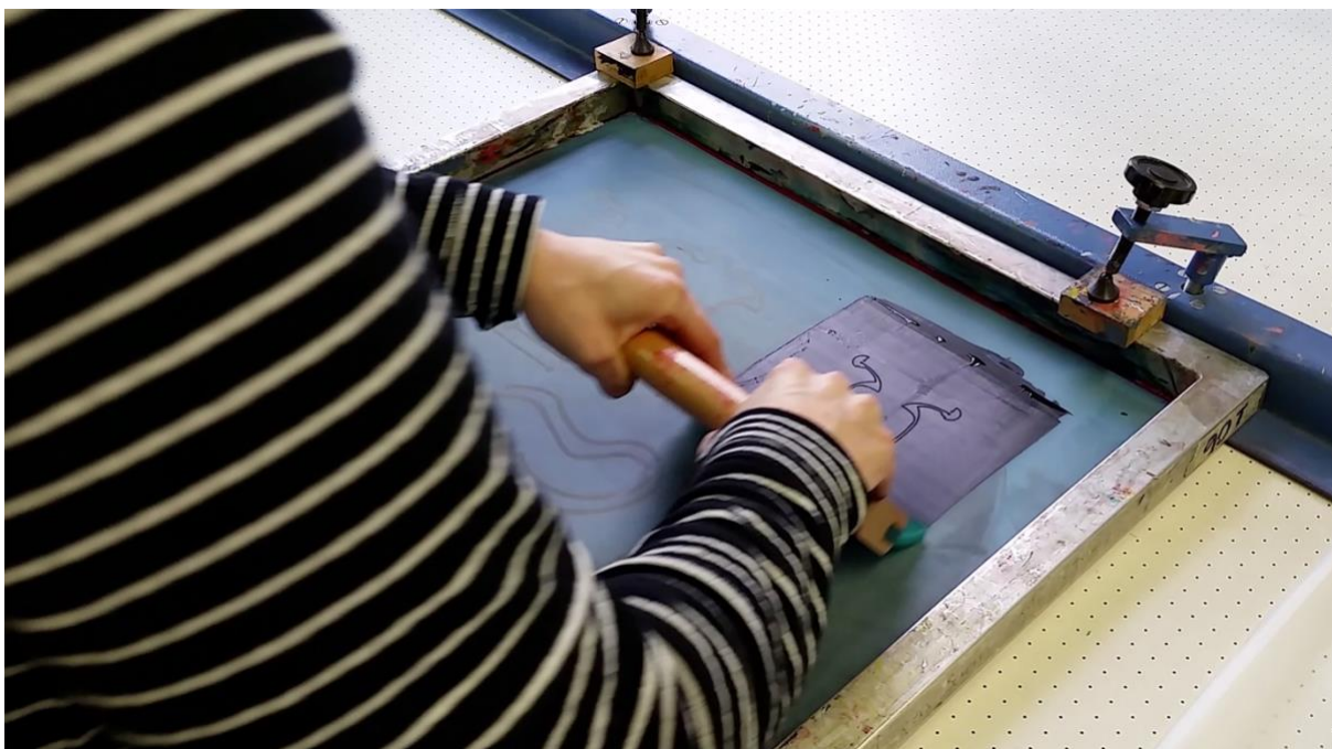
Figure 6. Testing the viscosity of Bare Conductive ink through screenprinting.

connected to computers and engage directly with interactive systems by sending electronic currents that can be transformed to keyboard inputs. Finally, such inks can be combined with other reactive, water-based inks to augment the diverse interactions and affordances. What remains is to further understand how printed objects can engage with humans and computers alike. We are now trying to further this research by experimenting with Art and Heritage collections through a series of workshops at museums, galleries and institutions. The current research that we are carrying out at Printeractive in the Design Lab at Liverpool John Moores University is exploring how these interactive materials can be used to trigger a wide range of actions with sensors and microcontrollers. Printmaking becomes central within this approach, whilst changing the creative processes, outputs and ways in which printmaking can be used to produce such artefacts. We are currently trying to change the paradigm of what is a print, this to say an object that goes beyond the page.