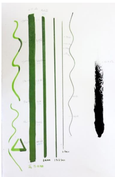
Figure 5. Screenprinted conductive ink evaluation of resistance readings