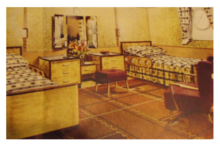
Figure 3 "Ivernia" First Class Stateroom, c. 1954

In the mid-1950s, four new ships<sup>43</sup> serviced a growing Canadian trade. For the Journal of Commerce , one of these, the "Saxonia" was very much of its time. More modern styling,<sup>44</sup> similar to its sister ship the "Ivernia", replaced the baronial styles of the past. The "Ivernia" brochure<sup>45</sup> promoted its modernity, not just in the style of the furnishings (Figure 3) and cinema (able to show films "made by the new wide screen process") but also in social practices – the smoking room being open to both men and women. The trade press, quoting Cunard News ,<sup>46</sup> praised the ship's design as giving "an impression of spaciousness and superlative comfort prevails …. The beginning of a new era in the history of the Cunard Line".