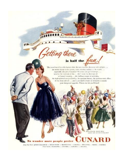
Figure 7 Getting there is half the <u>fun!</u>