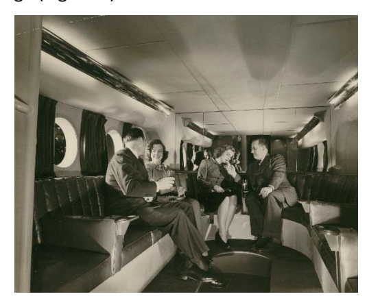
Figure 5 The lower deck lounge, Boeing Stratocruiser

Individual airlines were more competitive in their attitude to the shipping lines. By around 1950 Lockheed Constellations and the double-decked Boeing 377 Stratocruisers were replacing slower pre-war seaplanes. Trans-Atlantic flight times reduced to around eleven hours with one or two stops. Passengers, claimed the airlines, could "cross the ocean in comfort" not cooped up in a seat but, as a timetable illustration<sup>63</sup> showed, able to play a quiet game of cards or have a drink at the cocktail bar<sup>64</sup> – an image repeated in an image (Figure 5) from a Stratocruiser brochure.