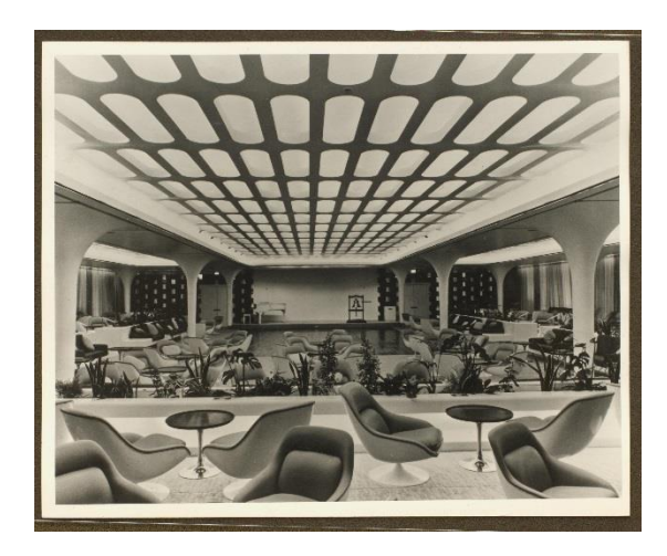
Fig 4 Queen's Room, "Queen Elizabeth 2"

BOAC.<sup>52</sup> The company and the government finally agreed the terms of a loan<sup>53</sup> and in 1967 Cunard launched the Q4 (which became known as the "Queen Elizabeth 2"). This ship was more suited to cruising but capable of being used on the North Atlantic. It brought about, according to Dawson, "a shift from ... an express vessel with hotel facilities added to that of a modern ocean-going urban resort with mobility and, when needed, North Atlantic, express speed".<sup>54</sup> The ship's interior design was also a matter of controversy, with an open debate over the need to show the very best that modern British design could offer. The external appearance was very distinctive and the accommodation substantially higher standard than any other British ship. Modern technology was at the fore, from the materials of construction through the power units to complex lighting systems designed to cope with the ship's dual role.