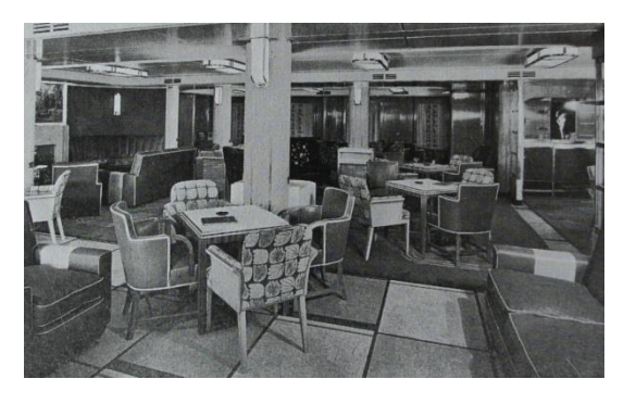
Figure 1 Smoking Room, "Britannic", 1930