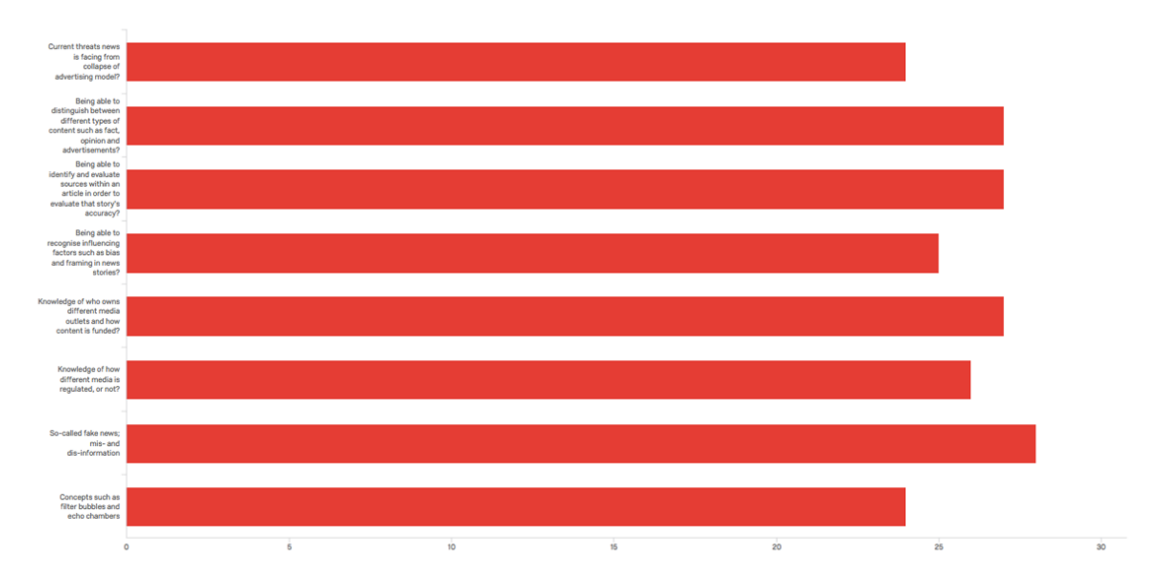
Figure 2: Do you teach any of these concepts?

The next question sought to establish any appetite among participants for introducing stand-alone news literacy workshops, or modules, on to their programmes.