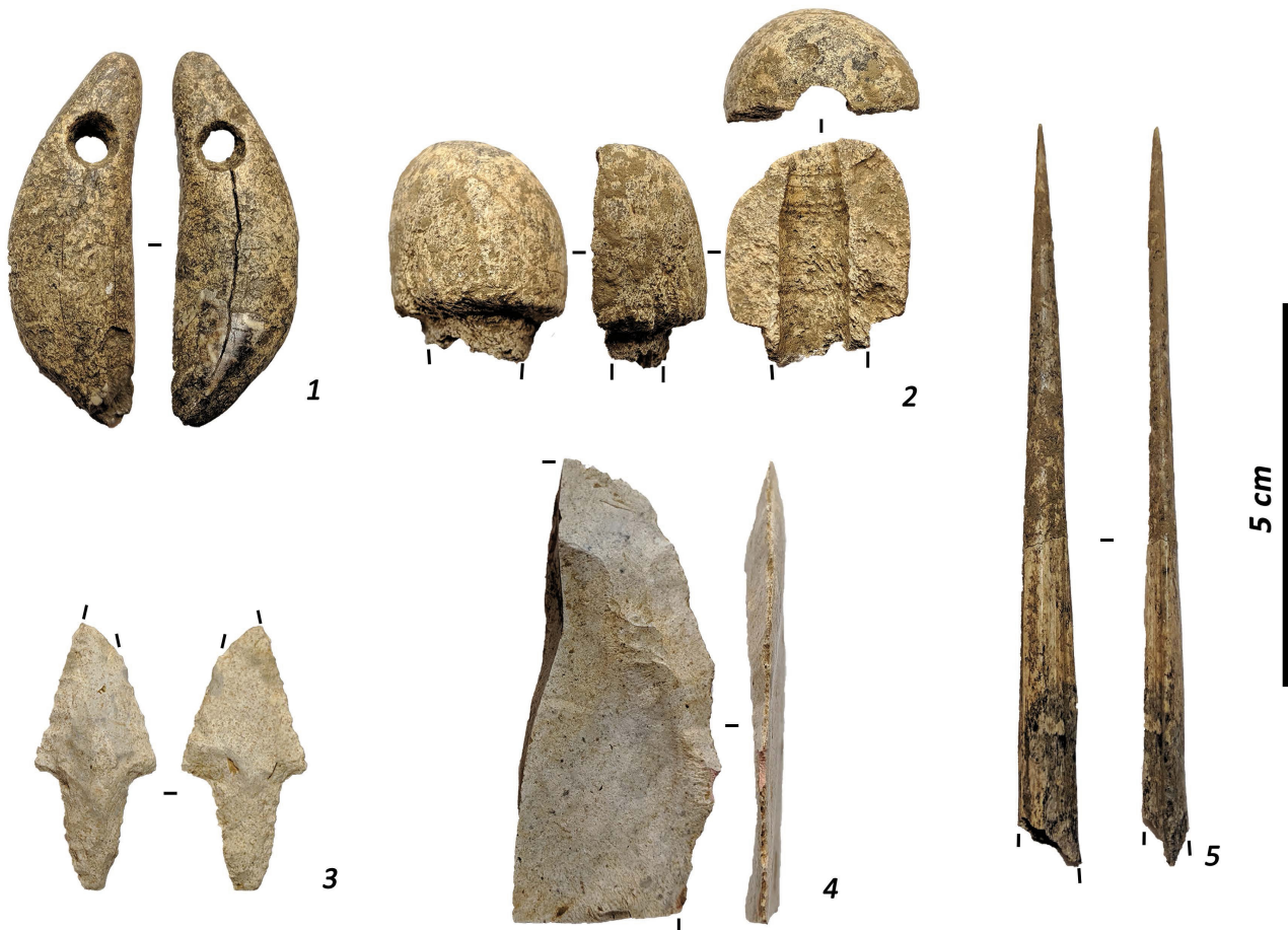
Fig. 2 – Archaeological evidence recovered 1999, 2016 and 2017.

1. Pierced carnivore tooth; 2. Bone object; 3. Tanged point; 4. Large flake with high gloss use wear; 5. Bone awl.