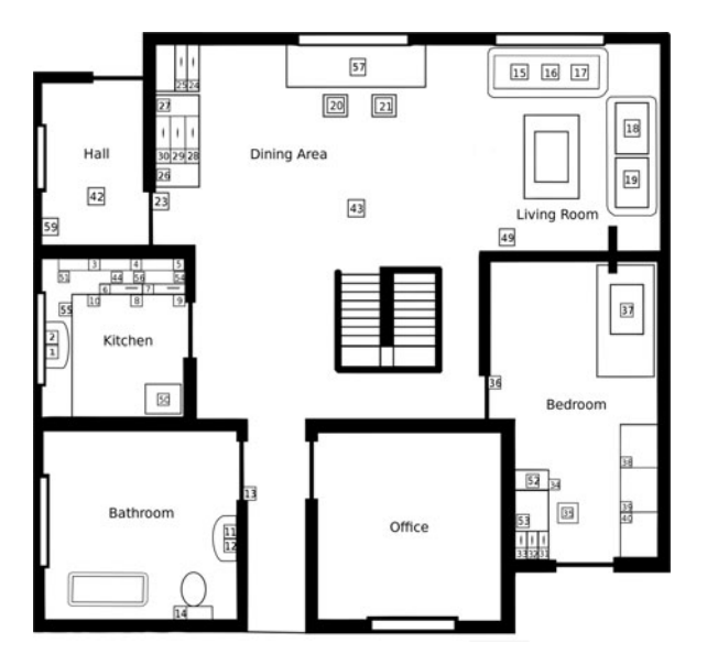
Fig. 2. Plan view of the ground floor of the University of Hertfordshire Robot House. Numbered boxes show the locations of sensors.

Therefore, encoding these autonomous systems using Brahms reduced modeling errors due to changes in abstraction level.