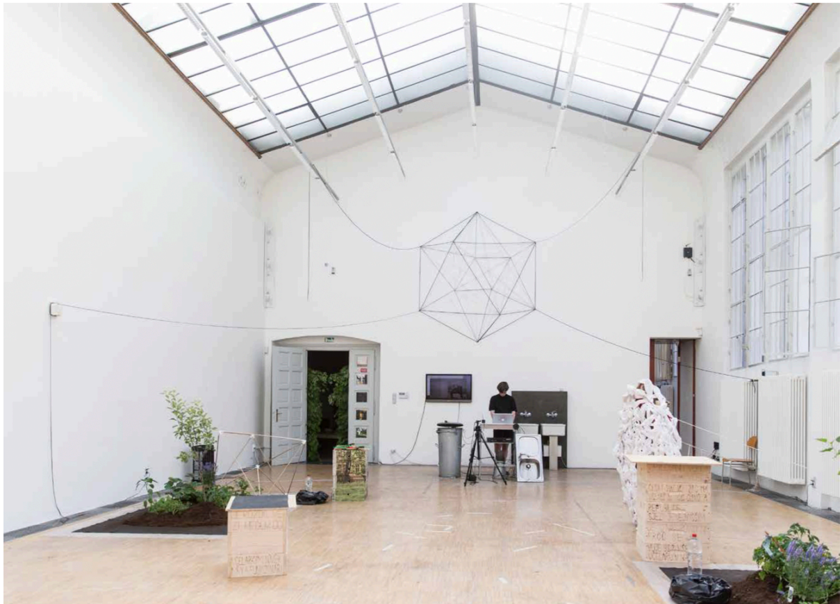
Figure 2 – Beyond Dispute (installation view), Prague, 2017

This experiment took place in spring 2017 during my residency at the Studio of the Visiting Artist at the Academy of Fine Arts, Prague. Working with 14 fine art students from three Czech artschools as well as Erasmus and International exchange students from China, Australia and the UK, the Team Syntegrity protocol to organise an 18-week collaborative project that resulted in a public performance and exhibition.