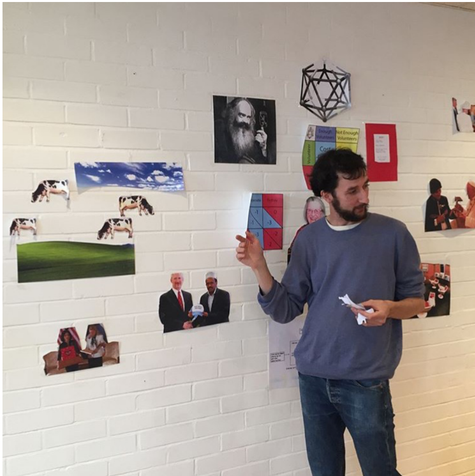
Figure 3 – Favour Bank: Meeting0 presentation, London, 2017