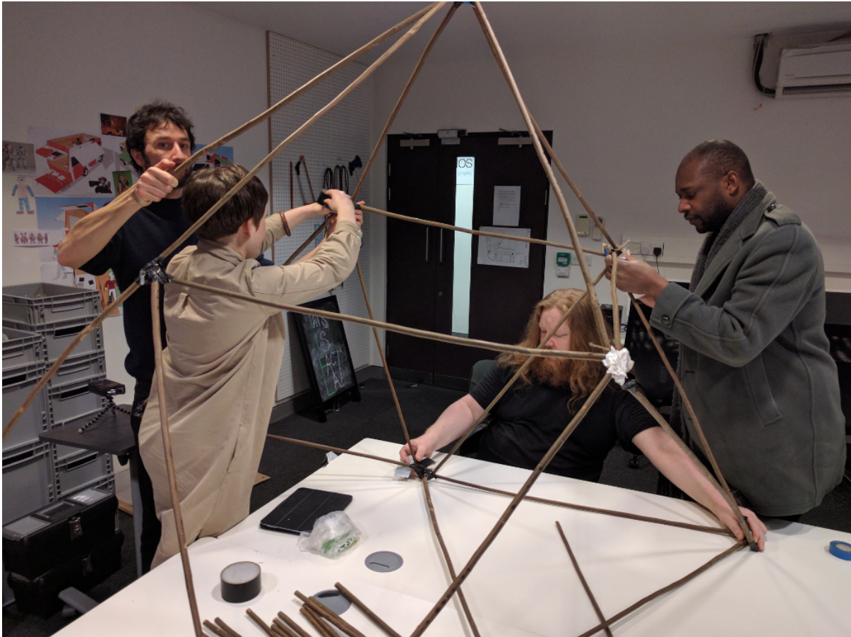
Figure 1 – Reading and Thinging, Liverpool, 2016