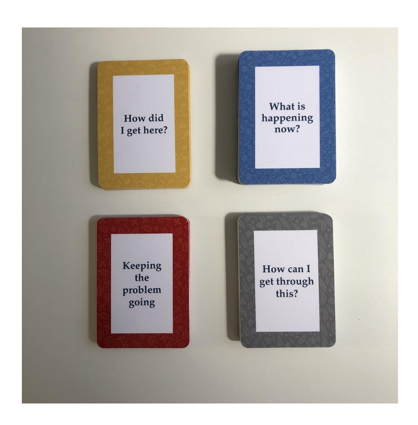
The Lay your Cards on the Table intervention