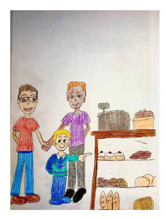
Figure 4: Illustration from Student e-book Maisie's Adventure

The student author of Maisie's Adventure promotes a dialogic view of learning and young children as capable and sophisticated language users, who are able to shape others in the same way they are shaped through dialogue themselves (White, 2017). This suggestion of agency reflects the idea of "children as peers instead of inferiors" (Medress, 2008, p. 23). Much emphasis is placed on dialogue in early childhood education, not least the pedagogy of listening as embedded in the highly regarded Reggio Emilia education approach (Rinaldi, 2006). In addition, the promotion of sustained shared thinking within the UK English Early Years Foundation Stage (English Department for Education (DfE), 2017) is an effective pedagogical strategy to establish intersubjectivity or what Oates and Grayson (2004, p. 56) frame as "a meeting of minds".