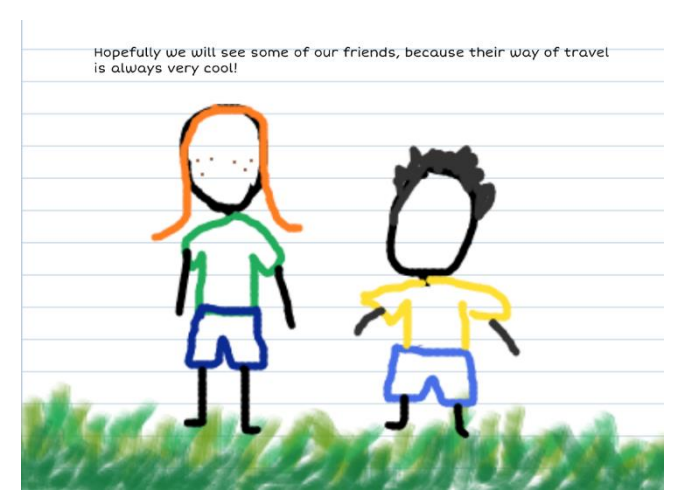
Figure 7: Illustration from Student e-book Our Journey to School

In this modern world where stereotypes rage within the media, it is important that the book underlies the idea of inclusion. The book was created to allow children from all backgrounds to be able to relate to either a character or a theme, furthermore, enhancing a child's self-esteem as it links to one of the three pillars for sustainable development, social equality, as they will feel accepted by society. (Student comment from rationale)