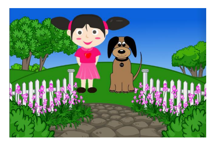
Figure 1: Illustration from Student e-book Fido's First Day Out

As evident from the excerpts above, students particularly celebrated the use of bright colours for children. This was readily witnessed in the e-books, as depicted in Figure 1: