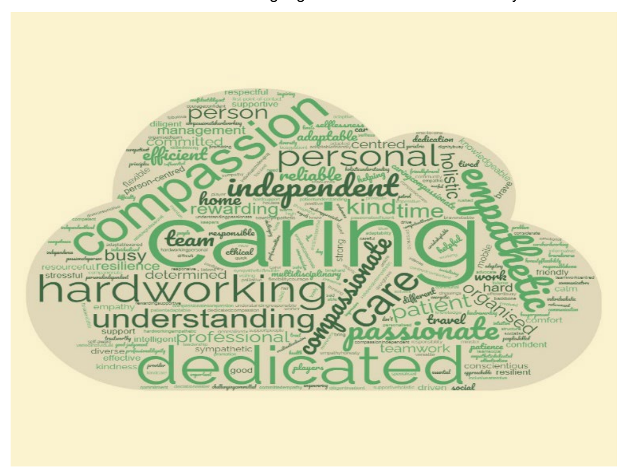
Table 4. This word cloud exhibits the language used to describe community nurses.

228 participants were able to use words to describe community nurses; the responses were formulated into a word cloud.