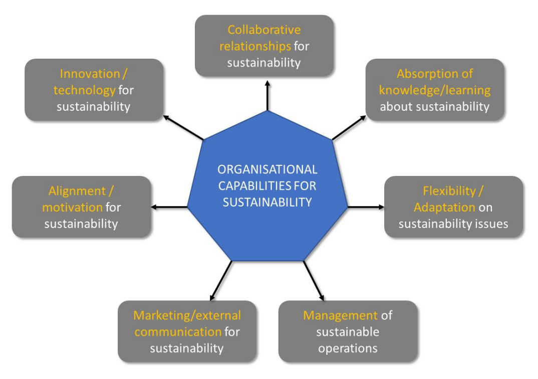
Figure 1. Organisational capabilities of sustainability (adapted from [62]).

The increased resurgence and need for sustainability practices has made organisations more acutely aware of the need to manage and govern depleting natural resources; where some of which have used this as a powerful enabler of competitive advantage, regardless of industry [56]. Notwithstanding this, one of the seminal challenges has been to really understand the impact of sustainability capabilities on the business itself, particularly the interaction between sustainability enablers, organisational dynamics and organisational capabilities [57–59]. Some of these issues were examined through: organisational learning and sustainable innovation capability [60]; through unique corporate sustainability capabilities (and measures) aligned to the TBL perspective [61]; or, through integrative frameworks [62], which present organisational capabilities and sustainability drivers/outcomes (Figure 1).