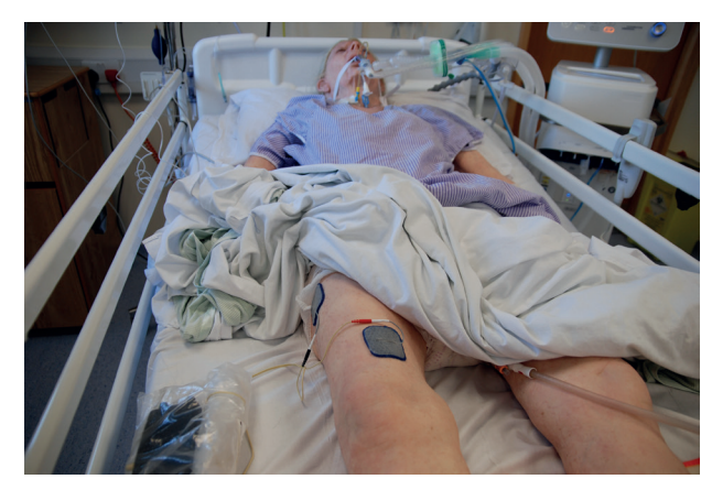
Fig. 1. Electrode positioning for electrical stimulation of the quadriceps (posed with a mannequin).

The application of NMES to treat ICUAW is well documented within the evidence-base (15–18). The primary objective of interventions has been to induce intermittent muscle contractions with electrical stimulation to minimize the loss of muscle mass and excitability, to strengthen these muscles and to enhance the recovery of mobility during and after discharge from the ICU (19). The findings from pre-clinical work on underlying electrophysiological mechanisms from healthy participants and data from critical care patients suggest that, to prevent ICUAW, an NMES programme should begin in the ICU as soon as medically feasible. This is particularly relevant to people with COVID-19, as early intervention is advised due to the often-prolonged