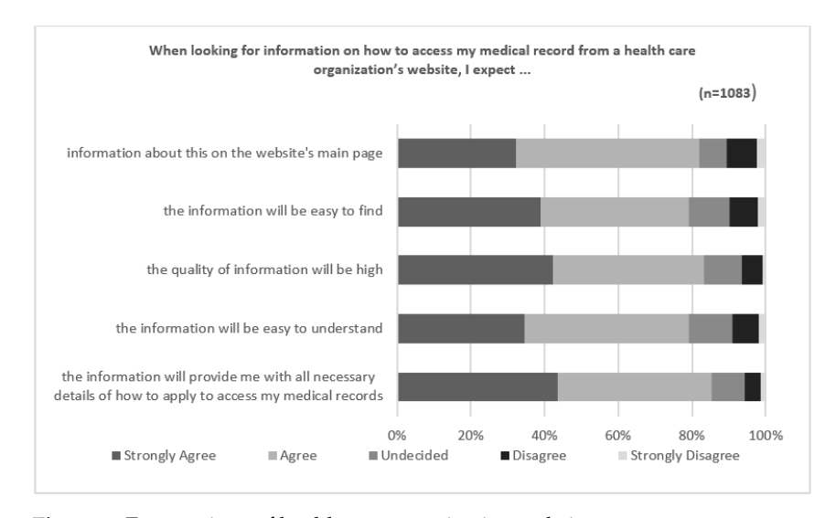
Figure 1. Expectations of health care organization websites.

A total of 1725 respondents completed the section of the survey being analyzed in this paper. Of those, 1083 were deemed valid responses, of which 62 (5.7%) were from Australia and 1021 (94.3%) were from the US. Known demographic information provided by 509 (47%) responses included 238 (46.76%) female, 265 (52.06%) male and 6 (1.18%) non-binary. Only comprehensible responses to the open-ended question were included. Responses such as "not applicable", "nothing to add", "none" and statements copied and pasted from the survey questions were excluded from the analysis, as these did not add meaning to the results. A summary of the responses to the statements preceding the open-ended question is provided in Figures 1 and 2 below.