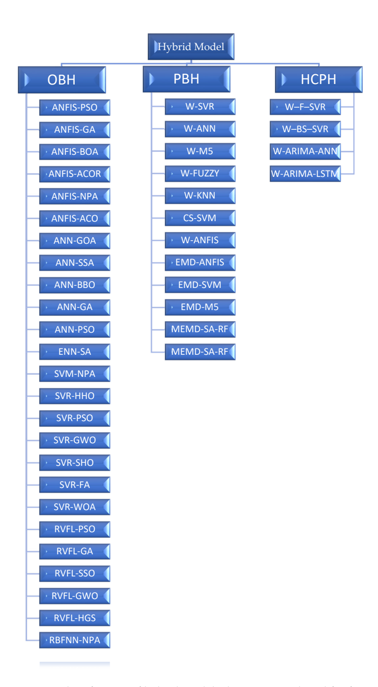
Figure 3. Classification of hybrid models that were employed for forecasting drought indices.