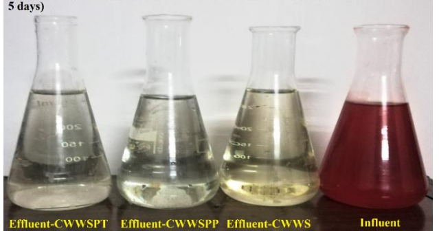
Fig. 4. Appearance of wastewater after 5 days for dye concentration in influent of 40 mg/L

Units of waterworks sludge (Influent dye conc. of 40 mg/L, Effluent after HRT of