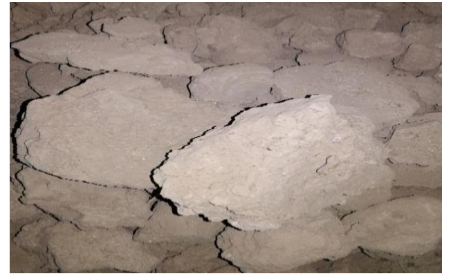
Fig. 1. Waterworks sludge from groundwater reservoir and complexes in Al-Amin/ Baghdad/ Iraq.