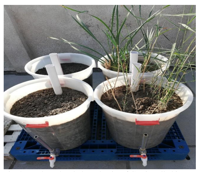
Fig. 2. Unplanted and planted units of CW installed in this work

The main bed is the waterworks sludge (WS) with the depth of 150 mm that packed above the gravel layers. One unit vegetates with Phragmites australis while Typha domingensis was inserted in the other unit. The remaining two units in each group were not vegetated and they can be used as control units. The planted units can be recognized from unplanted by subscript "P" with the first letter of the adopted plant. The first unit will be unplanted and operated with tap water only; so, the subscript "C" can be used to recognize it as a control unit. The water contaminated with soluble dye will be fed to the remaining three units. Table 1 presents the adopted designations for describing the CWs units to facilitate the discussion of obtained measured results.