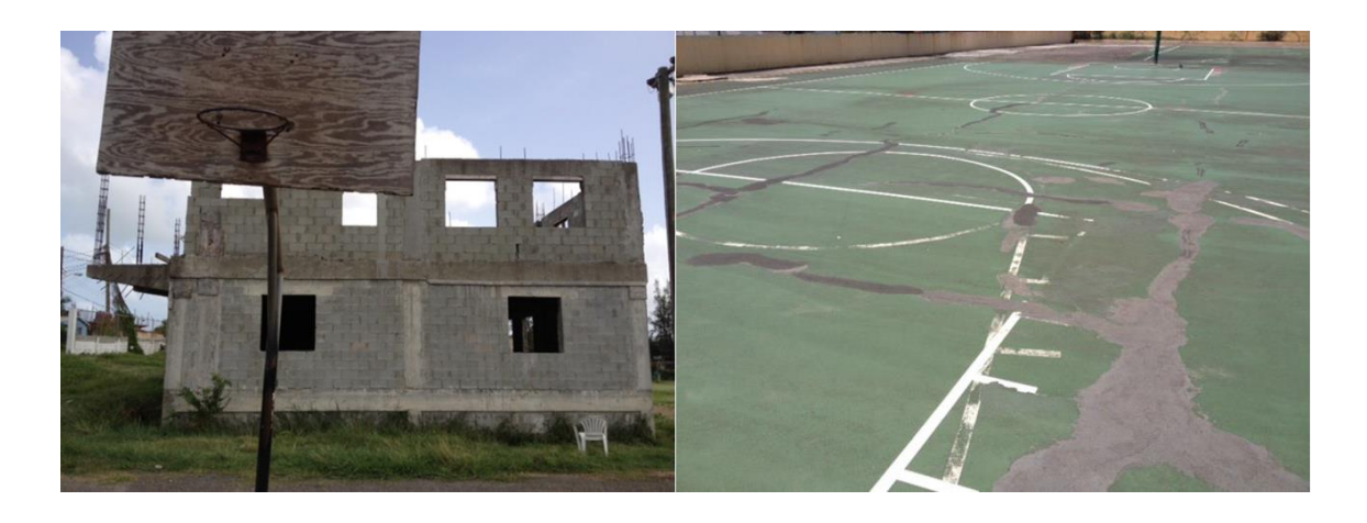
Figure 1:3. Photo sample sheet of ministerial sports facilities