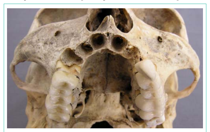
Figure 2: Lingual positioning of the socket of tooth 12 (white arrow) and antemortem loss of tooth 23 (black arrow).

A dental examination was performed at the Forensic Odontology Unit at the University Of Athens Dental School. The police investigation did not yield any antemortem dental records from the suspected victim's general dentist. However, a comparison of the postmortem dental findings with dental evidence on the anterior teeth as they appeared in the victim's photograph provided an acceptable positive identification. Specifically, the dental examination indicated that the socket of tooth 12 was positioned lingually, out of alignment compared to its neighboring teeth (Figure 2). In the antemortem photographs of the suspected victim, it can be observed that tooth 12 is also lingually positioned (Figure 3). In addition, tooth 23 was missing and in the corresponding area there was a fixed prosthesis