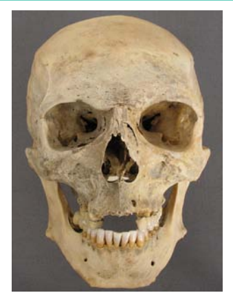
Figure 4: Frontal photograph of the recovered skull.

(bridge) with a cantilever (Figure 2). In the antemortem photograph taken a few years prior to the victim's death, tooth 23 appears to be heavily decayed and probably only its root was present (Figure 3). The extent of the lesion had most likely led to the extraction of tooth 23 and the re-establishment of the area with a dental bridge.