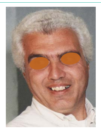
Figure 3: Antemortem photograph of the victim showing the lingual positioning of tooth 12 and the heavily decayed tooth 23.