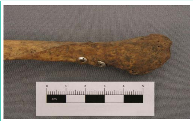
Figure 1: Fracture of left distal fibula treated by internal fixation.

The anthropological analysis revealed that the remains originated from a 35-55 year old Caucasian male, with a living stature of approximately 180-186 cm. The morphological assessment of the pelvis and skull indicated that the remains belonged to a male. The age was based upon the morphology of the pubic symphysis, the