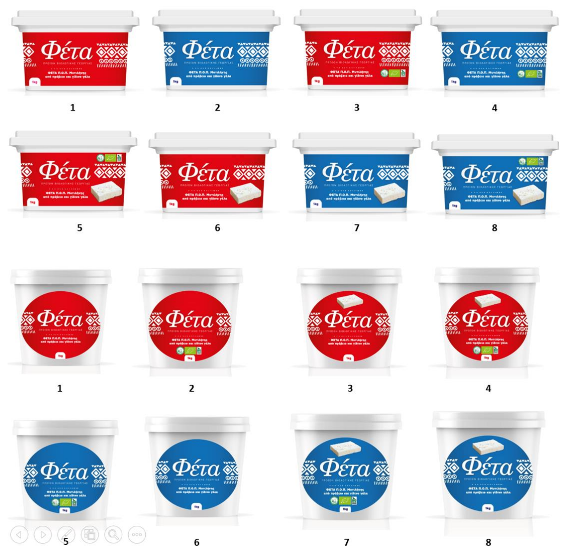
Figure 2: Th 16 feta cheese packages shown to participants