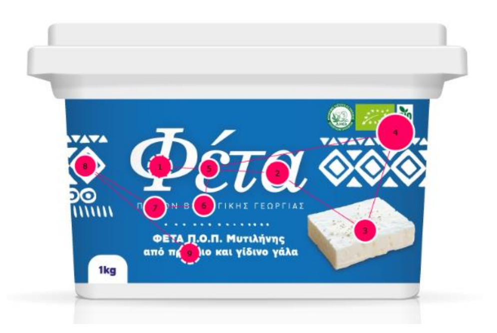
Figure 5: Gaze plot showing a representative eye movement from one participant on