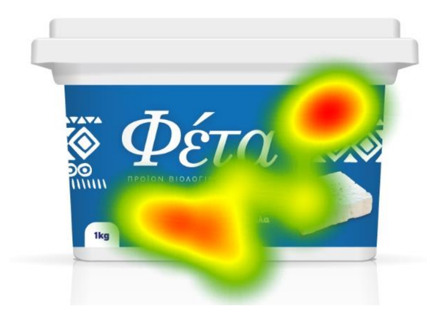
Figure 4: Heatmap showing the attention paid to specific feature on one of the package designs

image of feta cheese are significant compared to the shape (rounded) and he color (blue).