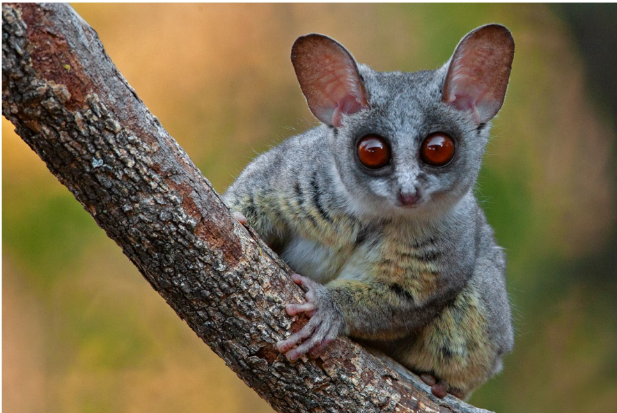
Fig. 1 The African lesser bushbaby, Galago moholi (Photo credit: Polley, 2019).

frugivores (Forbanka, 2018; Nekaris & Bearder, 2007). The African lesser bushbaby, G. moholi (Fig. 1), is the most well-known species of galagos (Table 1) with an estimated lifespan of 3–5 years in the wild (Dausmann et al., 2012) and a wide distribution range over Southern Africa. Despite the use of the species as bushmeat, traditional medicine or in the pet trade, these activities are not thought to lead to widespread population decreases (Masters et al., 2016). Rather, it is the effects of factors such as climate change and urbanisation which are likely to be the biggest threat to the species. We aim to review the current information available for G. moholi and make predictions on how the species might adapt to environmental and climatic changes in its natural distribution. In this review, we discuss the possible ecological and physiological response of G. moholi to climate change and urbanisation. Specifically, we discuss the effect of habitat quality and fragmented habitats on population density, genetic diversity and population fitness. As habitat alteration will likely lead to a change in resource availability, we discuss the possible change in G. moholi feeding ecology in order for the species to survive. This is followed by a review of the thermoregulatory response of the species to extreme weather events, before discussing the likely change in reproductive activity which could occur when habitat quality and resource availability change considerably.