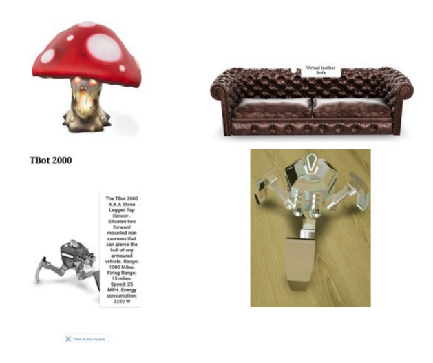
Figure 1. Virtual 3D Models

To demonstrate this further, see section 2 Methodology, A. Web-based AR application using Model Viewer. The process illustrates an astronaut 3D model uploaded into the Model Viewer editor, resulting in a Model Viewer code snippet. This code snippet can then be copied and pasted into an HTML file, which will then be uploaded to Github.