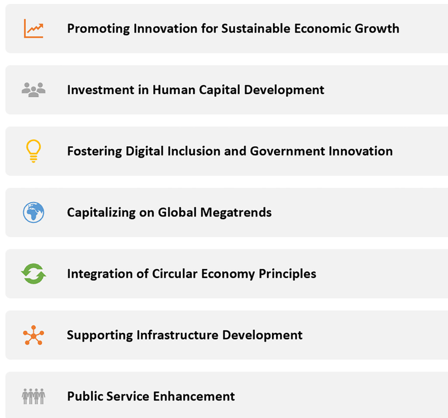
Figure 1. “Seven Pillars Guiding Policy Implications for Digital Construction”

governments and industries should prioritize investments in research, development, and innovation within the digital construction sector. This could involve funding research projects, supporting startups, and facilitating collaboration between academia, industry, and government agencies.