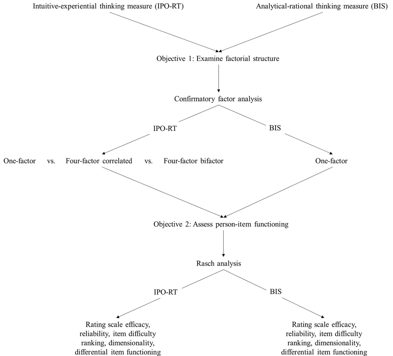
Fig 1. Flowchart depicting the phases of the research study.

https://doi.org/10.1371/journal.pone.0310055.g001