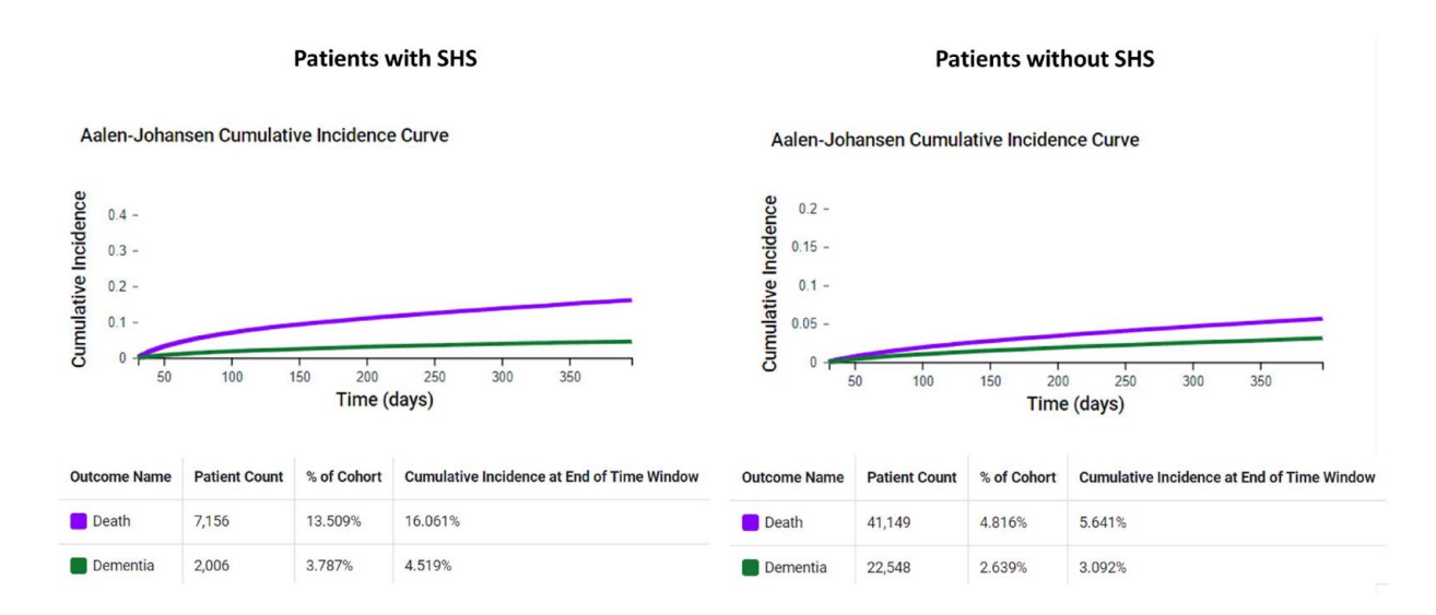
Figure 3. One-year Aalen-Johansen cumulative incidence curves for all-cause death and dementia. SHS: Stroke-Heart Syndrome.