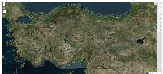
Figure 1. The display of fishing vessels on the BAGIS system [28]