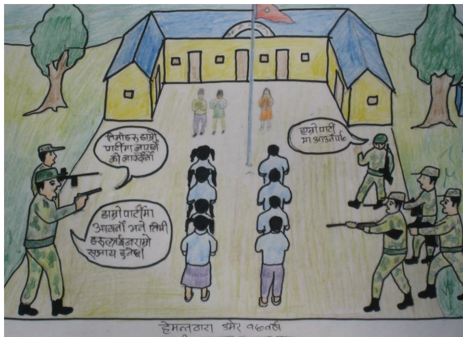
GAN (2010) Image from workshop with Children’s Club

The pressure felt by children at being trapped between all parties is depicted in the diagram below, where the text reads “join our party, no join our party ....”