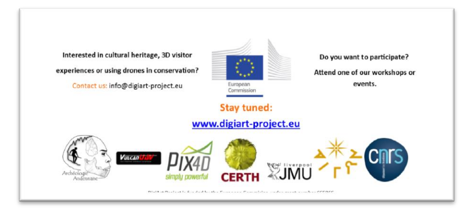
Figure 6 - Project flyer