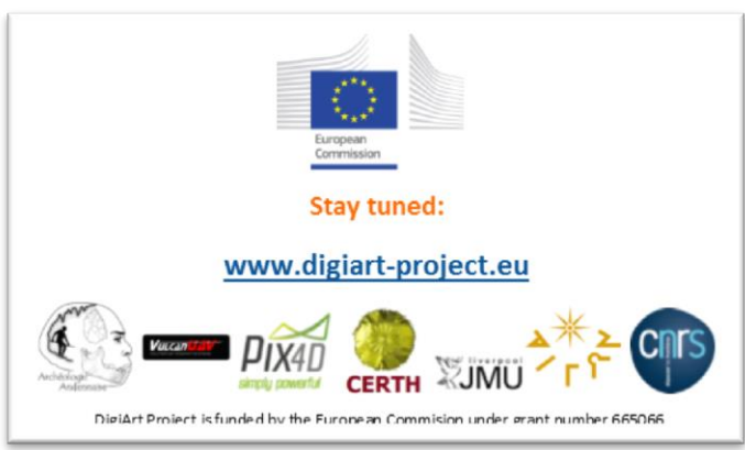
Figure 7 – Project lenticular business card month 1-12