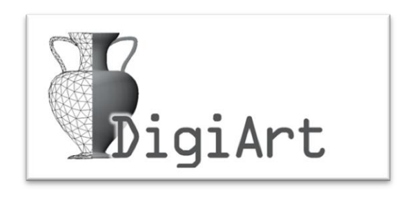
Figure 2 - Project Logo.

It represents DigiArt very well: The digital world is represented by the triangulated 3D surface (Digi); The Greek vase is a universal symbol of cultural heritage (Art). Other considerations in the design were the ease of use in printed matter, recognition and to maintain a light and dynamic look and feel.