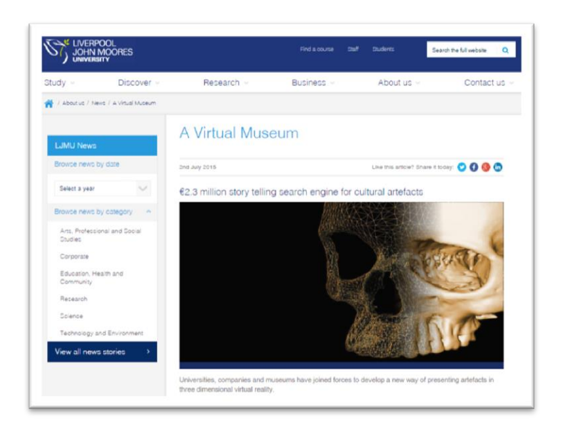
Figure 4 - Early Press Release and Press Article.

A press release was launched immediately after the start of the project and the kick-off and the story was retained by a number of articles in newspapers were launched immediately after the start of the project. In Belgium, the story was covered by regional and national radio, in the UK and Greece by the local newspapers. These opportunities were used to not only inform about the project, but also to advertise the open calls for training and content.