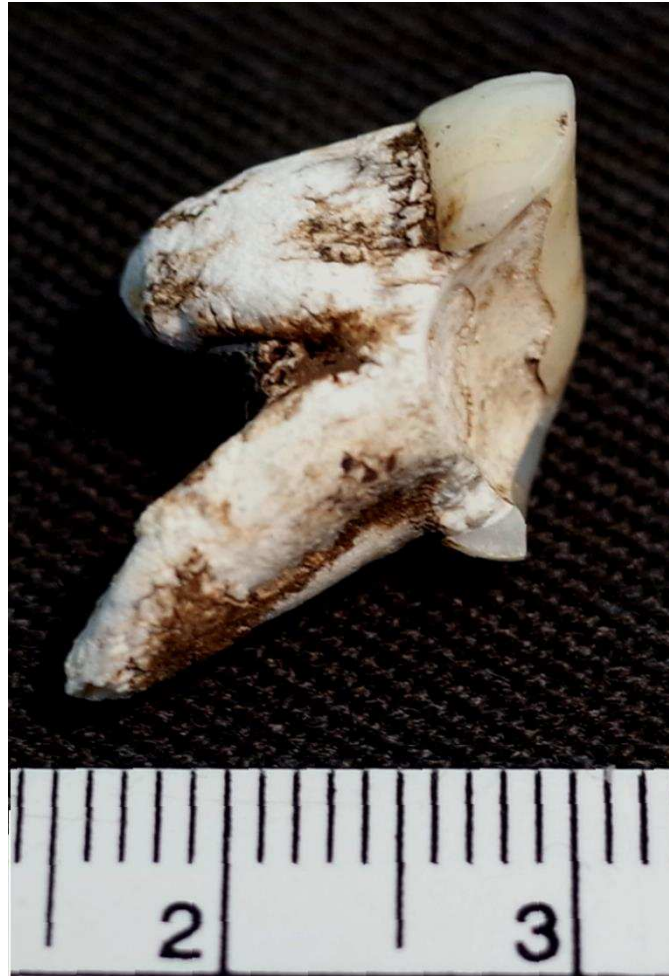
Figure 3. Steeply-angled wear on an upper left second molar (U.W. 101-528).