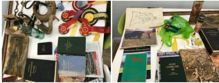
collection of personal objects belonging to the farm women