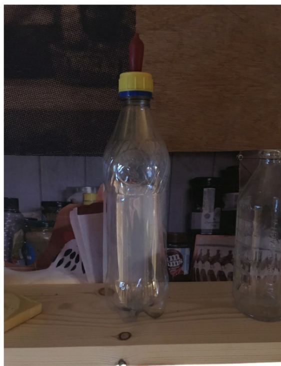
Irr Bru lamb feeder