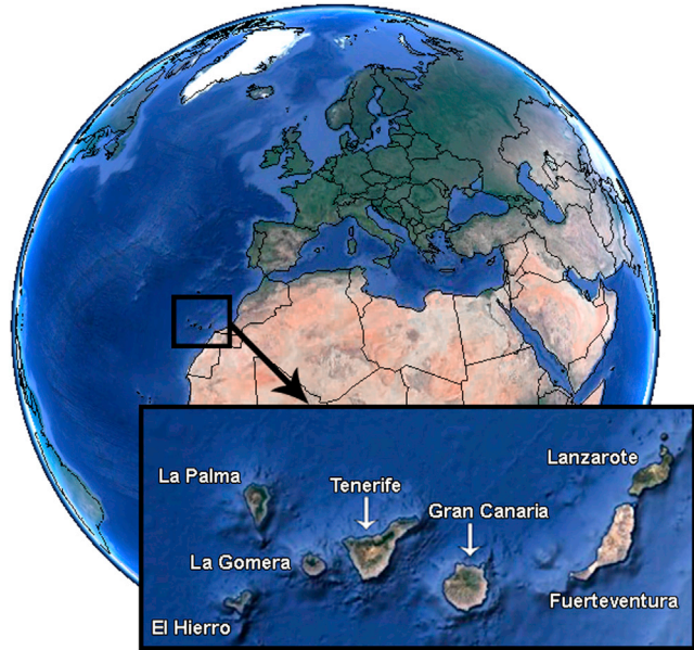
Figure 1. Map of the Canary Islands

NA, not applicable. C 14 lab numbers in order of appearance in the table: Ua-55344, Ua-55345, Ua-55346, Ua-55347, Ua-55348. See also Table S1 and Figure S1B.