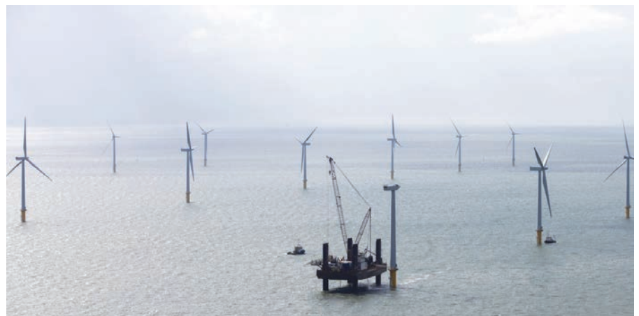
Burbo Bank Wind Farm, Liverpool Bay, UK

• “The horizon, which had already been disfigured beyond recognition by the first batch of turbines, is now all but obliterated by these latest additions which are absolutely massive and incredibly intrusive” (Local resident, Wirral Globe, 26.11.16).