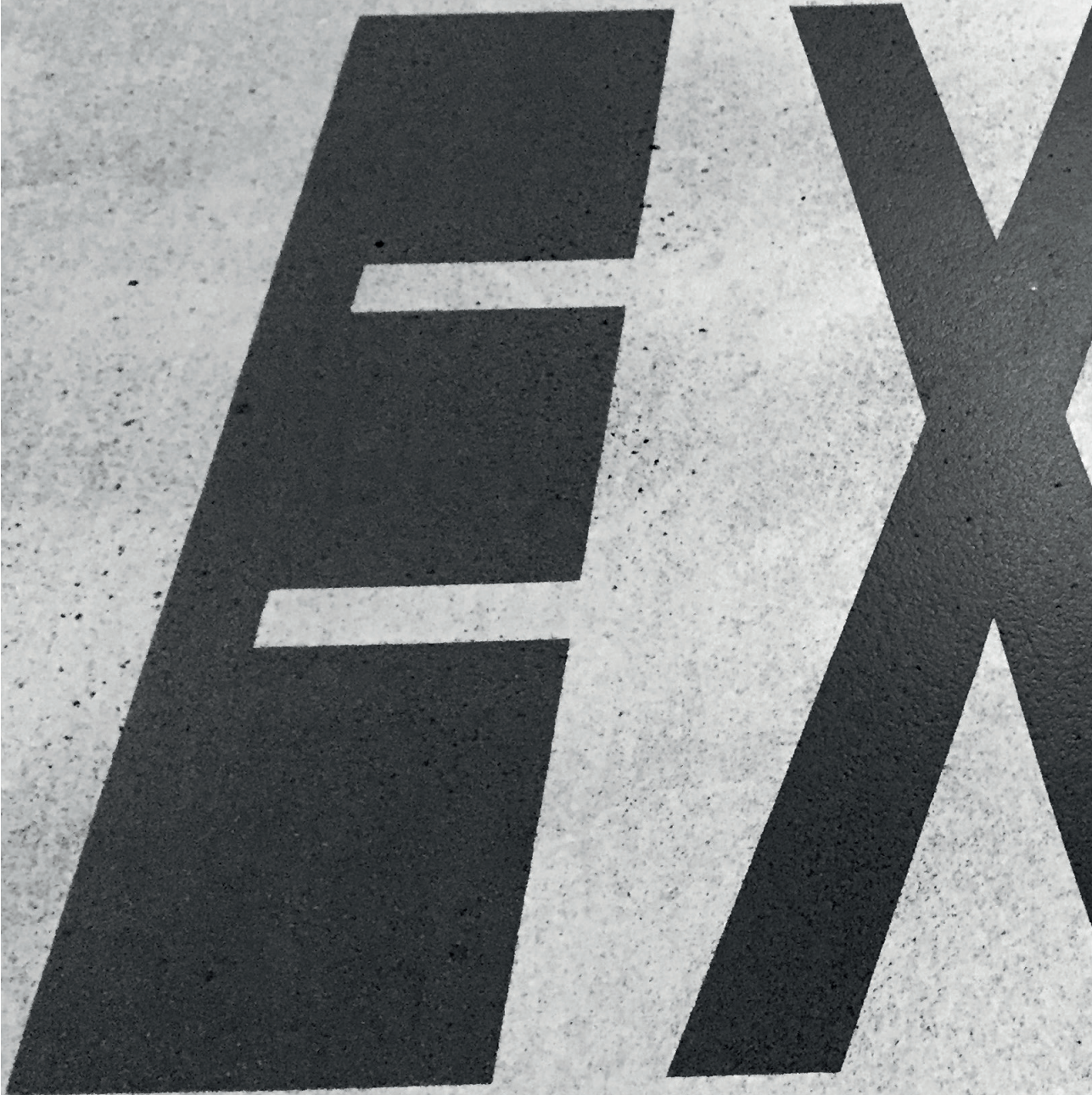
PHOTOGRAPH: LIVERPOOL RIVERSIDE (24TH JUNE 2016)