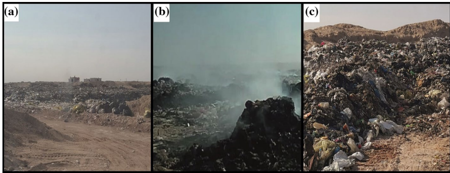
Fig. 4 Field observation of the landfill site: a entrance, b outbreak of fire, c control over leachate and emissions

occasionally covered with a thin layer of sand. The frontline staff normally wear boots, distinctive overalls and hats, but safe operating procedures and regular health checks are not in place.