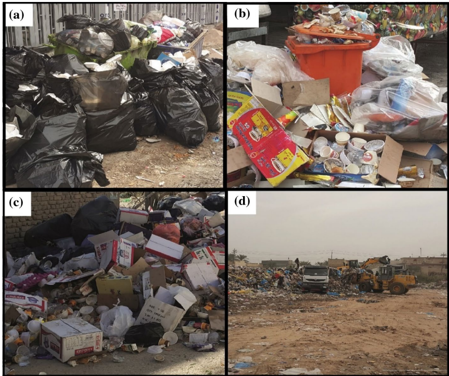
Fig. 3 Field observation of the collection system: a MSW accumulation around collection points, b litterbins overflowing, c illegal dumping and d TTS site

illegal dumping of MSW and improper siting and management of the TTSs was observed. This situation is similar to other large events such as Hajj (Alsebaei 2014), three open-air festivals in Germany (Cierjacks et al. 2012) and Kumbh Mela (Gangwar and Joshi 2008). Respondents attributed this to the low truck mobility due to overcrowding, inaccessible streets, blocked streets and poor planning.