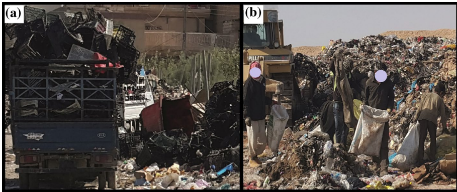
Fig. 5 Field observation of the informal recycling sector: a separated materials at a TTS and b informal recycling activities at the landfill site

opportunities (Masood et al. 2014). However, scavengers work in poor environmental conditions, having no appropriate clothing or equipment (e.g. safety shoes and gloves) nor an infrastructure for recycling purposes (Fig. 5b).