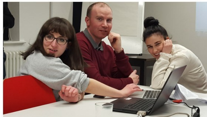
Image: ATA network at The Whitworth, Manchester, Autumn 2015