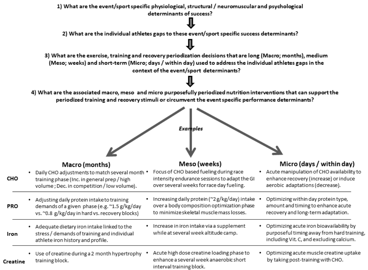
Figure 1. A methodological framework required for successful nutrition periodization, including examples of macro- (months), meso- (weeks) and micro-cycle (days / within day) nutrition periodization interventions for carbohydrate (CHO), protein (PRO), iron and creatine.