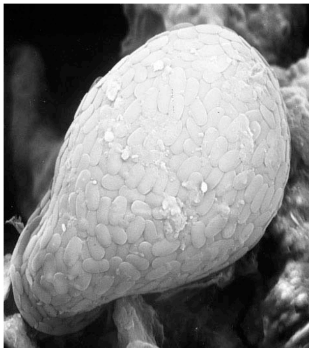
Figure 1. Corythion dubium from the underside of the lichen Flavoparmelia baltimorensis collected from near the Cheapstake and Ohio canal (close to the site of the lichens used in the culture studies described in this paper) – this specimen was erroneously described as a ‘chrysophyte’ in Schwartzman (1999). The test of this taxon varies between approximately 25 and 65 \mu\text{m} in length (Ogden and Headley 1980). In addition to testate amoebae diatoms were also found on the underside of this lichen thallus (an example is illustrated on Schwartzman 1999, p. 70).

favourable. These studies confirm the presence of various protists living in or on lichens but raise many new questions.