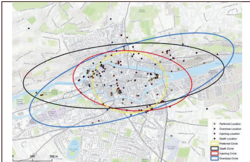
Figure 2. 1SD weighted ellipses of all locations, by behaviour type.

A mapping exercise presented visual information around injecting sites, locations of overdoses, fatal overdoses, and preferred location of the SIF. Participants identified where they injected, and this was sub typed as described above, into public buildings, private accommodation, or open/street space. Similarly participants identified where they had had