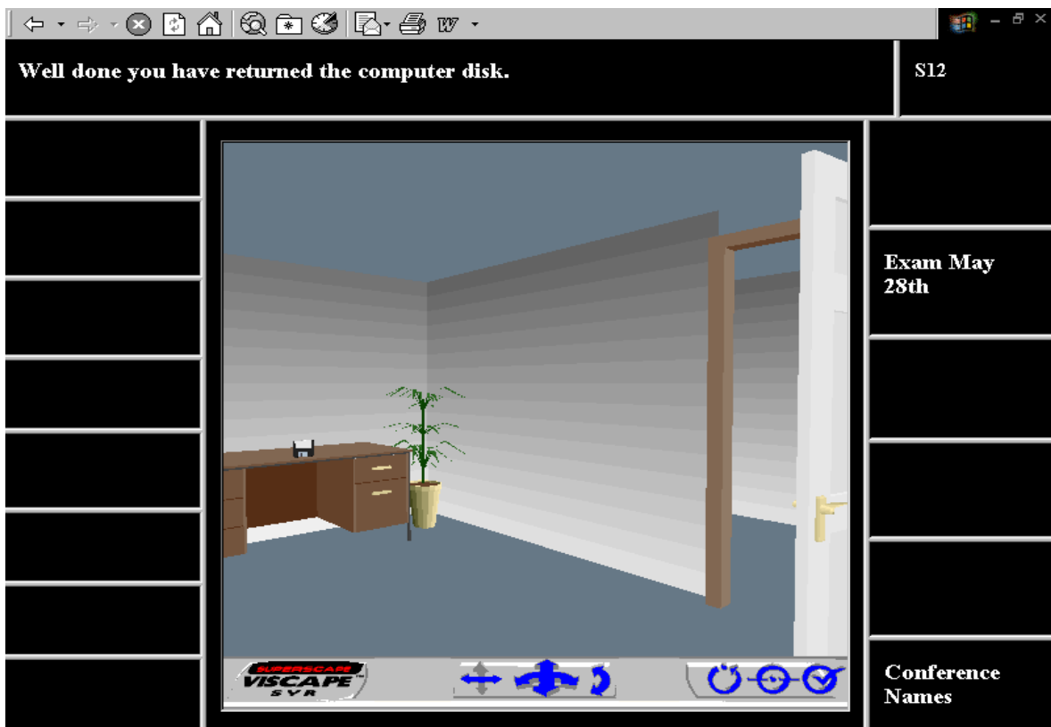
Figure 1: A screenshot from the virtual environment