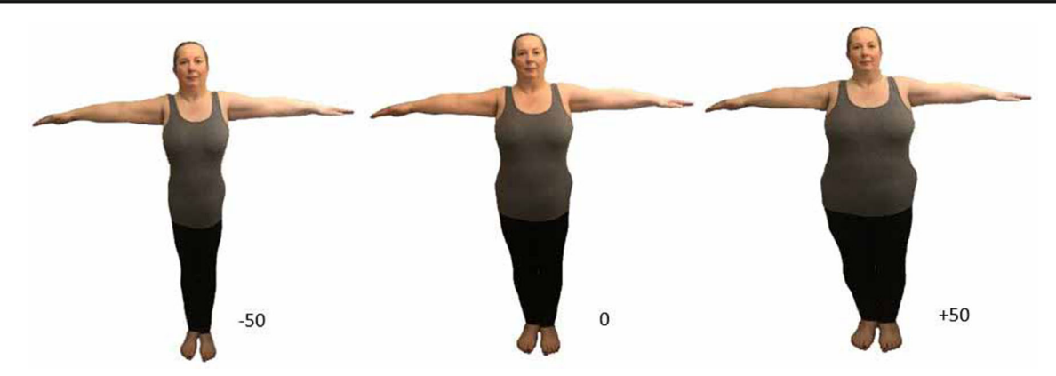
Fig. 1 Visual representation of the body distortion technique, using the Body Image Revealer (BIR); veridical (0 = original, centre), distortion (-50 = slimmer and +50 = fatter) of body size. Images of participants were viewed against a white background

use as covariates in our multivariate analysis and to avoid variance inflation due to multicollinearity amongst explanatory variables. We found four components, corresponding to the following: (i) the body part responses in the BUT (referred to henceforth as BUT-Parts); (ii) attitudinal responses in the BUT (referred to henceforth as BUT-Att); (iii) responses related to social pressure from the SATAQ-4 (referred to henceforth as SATAQ-Press); and (iv) responses related to internalization from the SATAQ-4(referred to henceforth as SATAQ-Int) (see Online Resource 2).