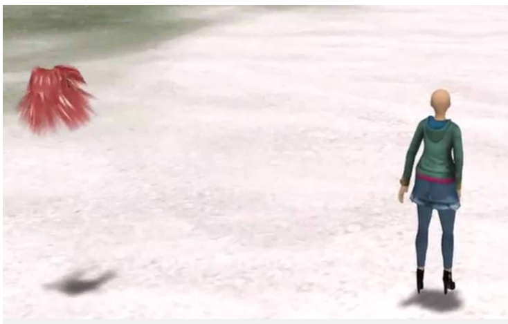
Figure 1. Letty's hair goes on tour

Immersing in a 3D virtual world is an important prerequisite to understand the affordances of these environments and their implications for participants' learning experiences. Based on researcher and participant reflections on the affordances of 3D environments the skills required to facilitate learning in VWs compared with non-virtual learning, it is evident that users of 3D VWs often replicate their non-virtual habits, conventions, norms and attitudes in their virtual environments (Thomas, 2010). In relation to this study, it was evident that the teacher participants demonstrated similar behavior, as they arranged and furnished their classrooms or built their houses with roofs and walls even though it