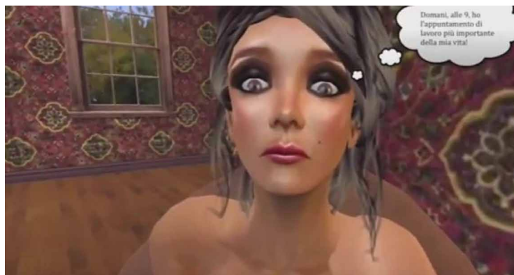
Figure 8. Excerpts of Machinima Productions Note: For video examples of machinima, see [ https://www.youtube.com/watch?v=GopJmoH3-s4&feature=youtu.be ]

Challenges observed during the training courses included time issues (e.g., the duration of time and effort required to produce even a relatively short machinima) and technical difficulties (e.g., audio-related problems which resulted in poor quality recordings); the latter was solved by overdubbing the machinima with new audio recordings (Schneider, 2015b). Another challenge was the different language backgrounds of the participants. Though English was used as lingua franca to communicate, not all participants had the same level of English, and this occasionally caused misunderstandings. Despite the challenges, teachers reported that their English had improved significantly during the course through collaboration, and reading and listening to dialogues during the filming sessions (Tsou, 2011; Schneider, 2015b). Though all teachers were highly motivated and engaged in the training and