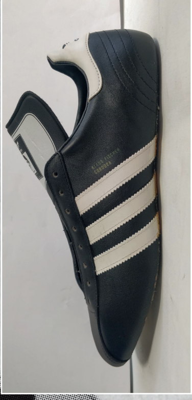
adidas KLAUS FISCHER CORDOBA football boot conversion