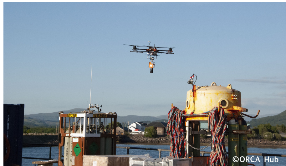
Figure 2. Unmanned aircraft operation near offshore structures.

EXAMPLE: Offshore energy assets, such as wind farms and oil platforms, are dangerous and difficult to access for human workers. Consequently, such activities are also time-consuming and expensive. Unmanned aircraft are increasingly used to perform remote inspection tasks in which different parts of the offshore structure are examined using cameras or touch sensors (see Figure 2).