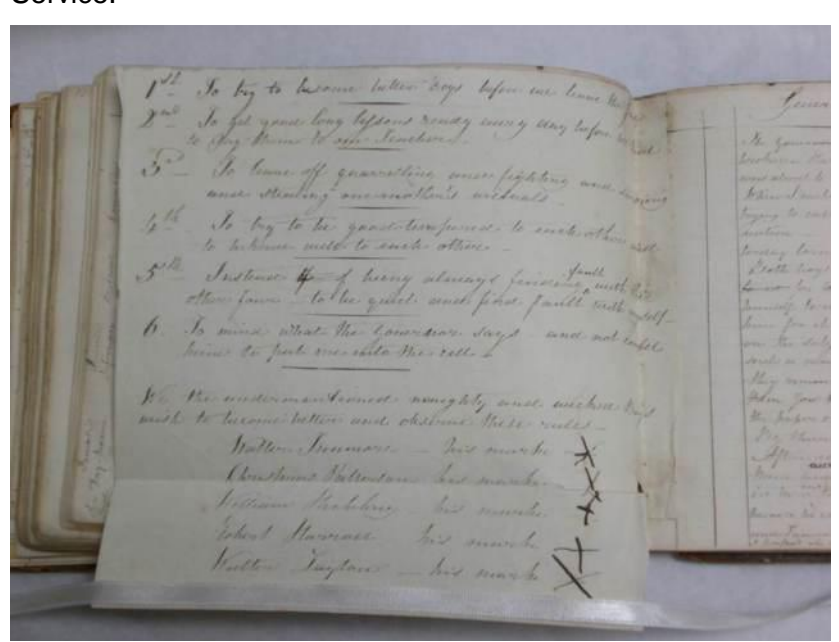
Illustration 6: The Rules, pasted in Sarah Martin's Everyday Book, Monday 13 January 1840.

Images from the visitor's journals became part of the visual and material objects I increasingly used not just to illustrate the story but as integral components of it. The visual and hypertext elements of web content make it possible to explore much more effectively than in print publication the material, social and emotional histories of cultural objects, as many bloggers are discovering, including Vicky Holmes