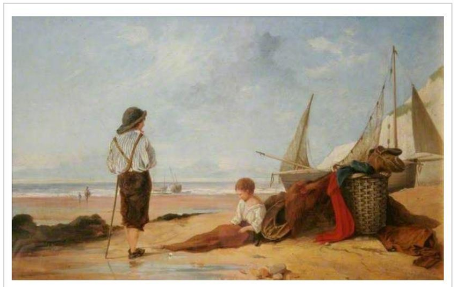
Beach Scene by Joseph Stannard (attributed to) Oil on canvas, 26 x 43 cm Collection: Great Yarmouth Museums

Illustration 7: Helen Rogers, 'Grey Cotton Shirts'. 'Beach Scene', attributed to Joseph Stannard. Courtesy of Norfolk Museums Service (accession number GRYEH: 2005.86).