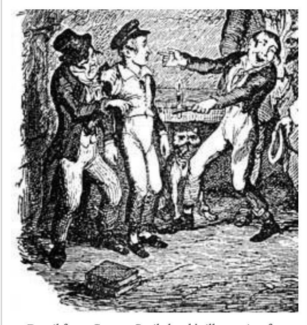
Detail from George Cruikshank's illustration for original serialisation of Oliver Twist (1837-9).