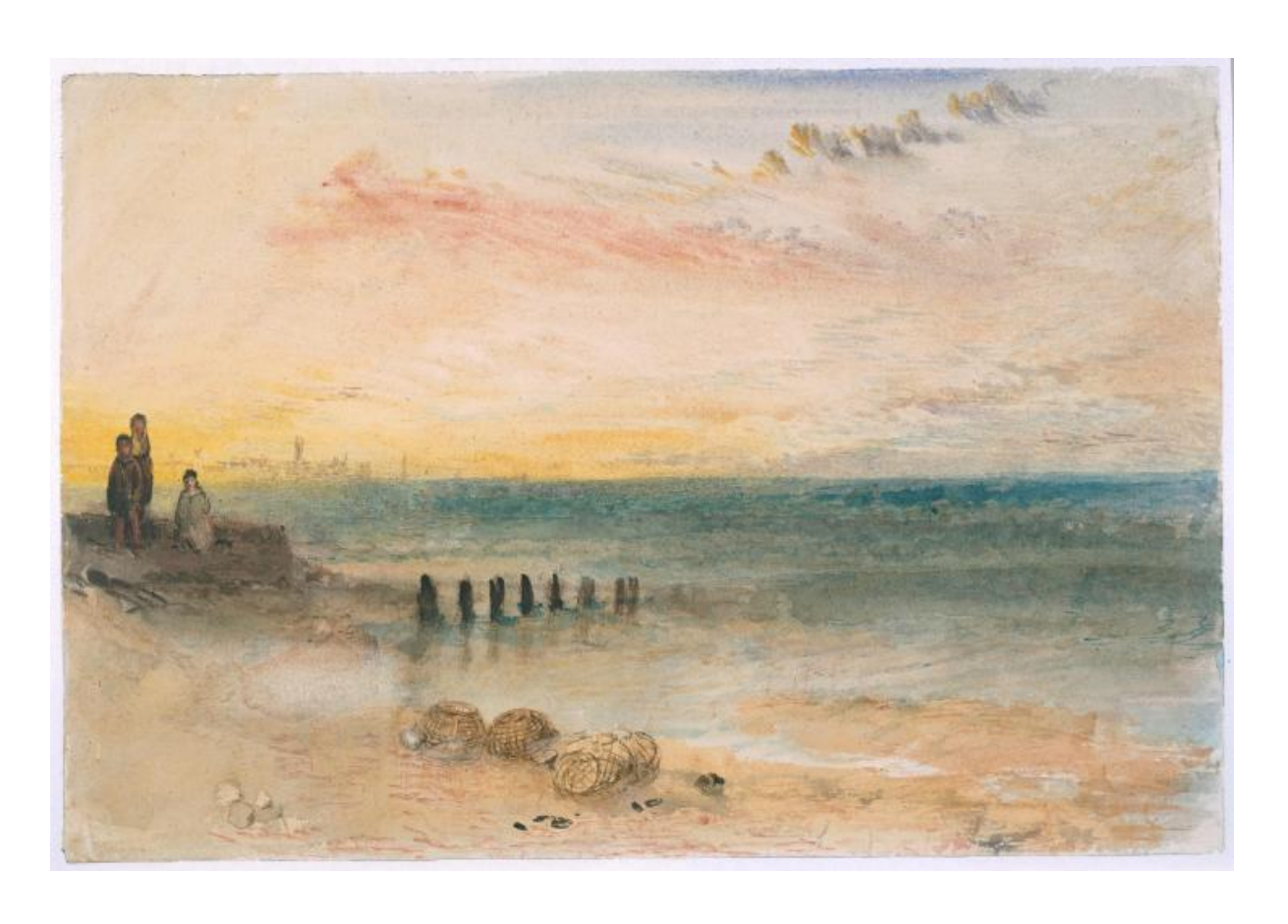
Illustration 9: Joseph Mallord William Turner, 'Yarmouth, from near the Harbour's Mouth', c.1840.

In starting the blog I hoped to discover ancestors of these boys and other individuals and families whose histories I reconstruct through the penal and parish registers, for this is one method I use to analyse patterns of re-offending and desistance and to assess the impact of the visitor's 'rehabilitation' programme. It is also among a number of reasons I do not anonymise the individuals I examine, not least because the research is based on documents in the public domain. I am pleased that descendants contacted through genealogy sites enjoy reading my blog and say it does justice to their family history. While the ethics of identifying individuals in the criminal justice record was raised at the first meeting of Our Criminal Past, it seems to me there is no reason to treat the issue any differently in blogging than in scholarly publication.<sup>32</sup> Caution and sensitivity should be taken when dealing with the recent past and within the life-time of those affected, or cases involving criminal insanity, but practice can be guided by existing protocols developed within the discipline, notably