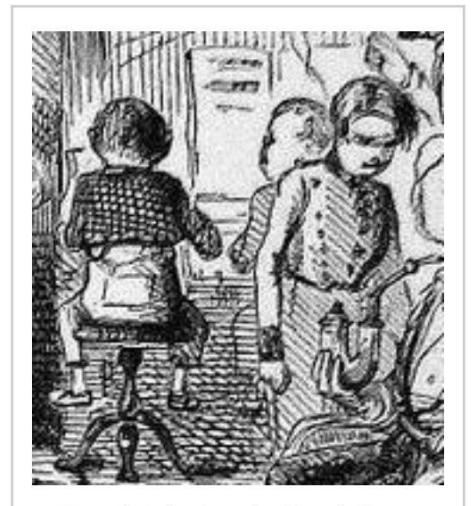
Detail: John Leech, Sketch from Punch 1849: How to make the culprits comfortable; or, hints for Prison Discipline