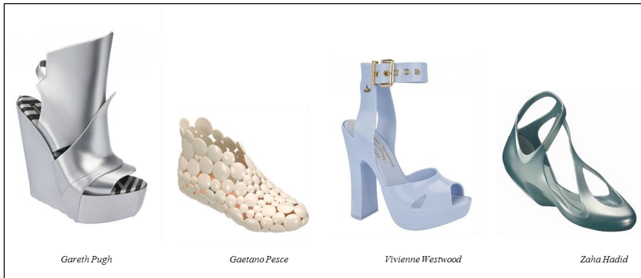
Figure 3: Futuristic, daring and modern forms of Melissa shoes

with meanings associated with plastic's properties: a flexible, modern, versatile, and irreverent product.