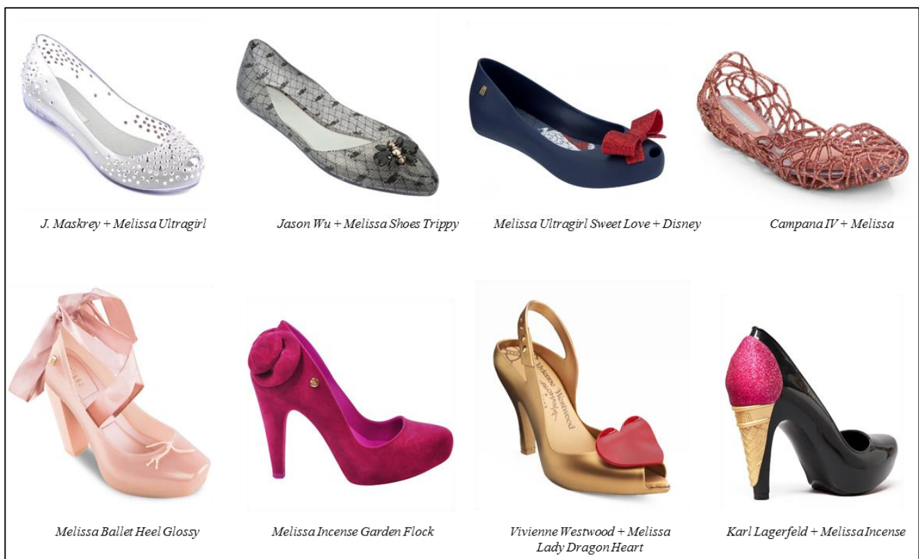
Figure 2: Textures and shapes of Melissa shoes

As the quote that introduces this section illustrates, the Melissa brand builds its relationships with consumers on positioning plastic as the material of choice and by investing in technological developments that encourage tactile interaction with the products, like a finish that is velvety to the touch and evoking childhood memories through a bubble-gum scent. In order for this interaction to happen, the shoes have to be designed with such intention in mind. As noted by Dant (2008, p. 12), “[t]o design an object is to build into it characteristics of form and function that will be responded to by the consumer through material interaction”. Thus, designers’ ability to transfigure the plastic influences object–consumer relations and the outcomes of these relations.