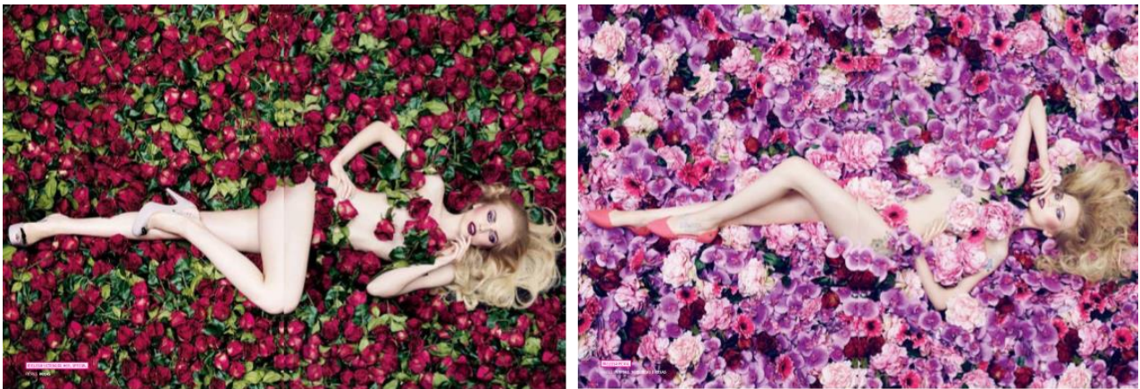
Figure 5: Melissa advertisements – “Brazilian Beauty”

As a result, the Melisseira identity can be described as one characterized by drama, intensity, and passion – which are somehow reconciled with the cuteness, girliness, and romanticism of many Melissa shoes. In fact, this very duality is present in the objects themselves, which even when designed in futuristic, daring, and modern forms (Figure 3), still come in pastel colors to please the romantic Melisseiras and are infused with a bubble-gum scent, which is known for triggering nostalgic childhood feelings. Melissa advertisements also offer Melisseiras resources to align those two aspects of their identities. The series of print advertisements called “Brazilian Beauty” (Figure 4) makes reference to the 1999 Oscar-winning film American Beauty .