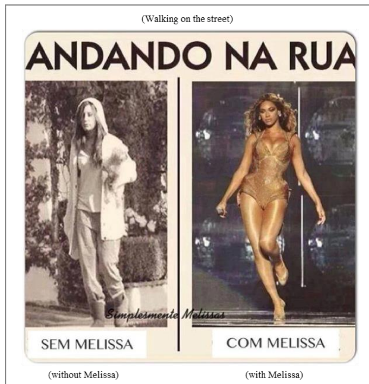
Figure 6: Simplesmente Melissas (Simply Melissa) – Materialization of cultural practices

sense of collective identity. Illustrating what it means “to Melisse,” an image in black and white shows one girl walking crestfallen in a hoody and slippers next to an iconic photo of pop singer Beyoncé in which she walks on stage in high heels, wearing a golden outfit, her hair flowing. In this image, the cultural ideal of shoes as objects gifted with transformational power (McDowell, 1989) allies with consumers’ imagination and emotional energy to materialize the cultural practice of Melisseiras. The meme materializes the feeling and emotional energy contained in imagining that “melissing all around” is equivalent to feeling like a pop diva.