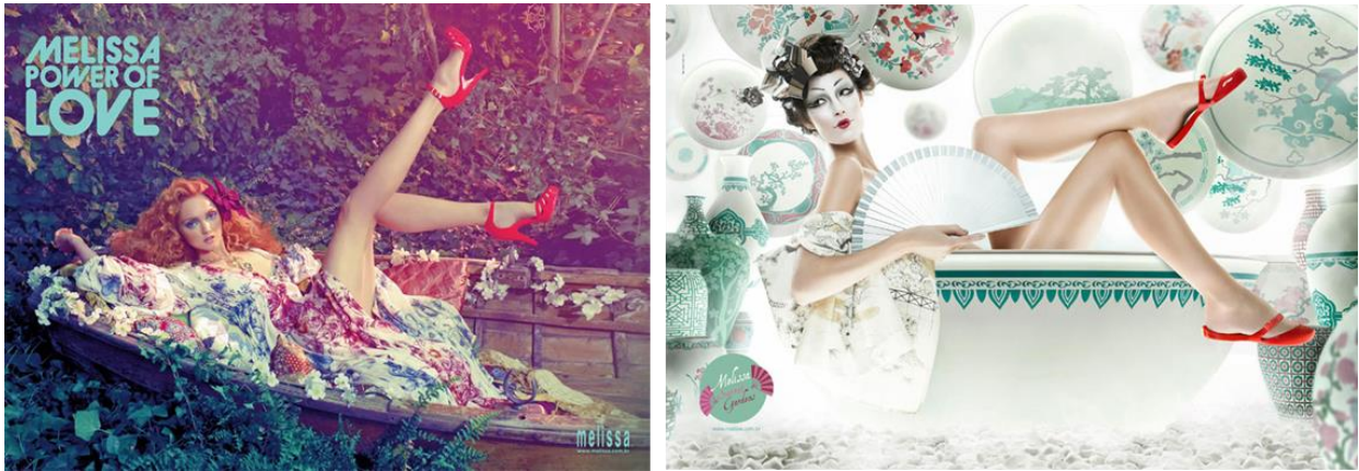
Figure 4: Melissa advertisements – “Power of Love” and “Secret Gardens”