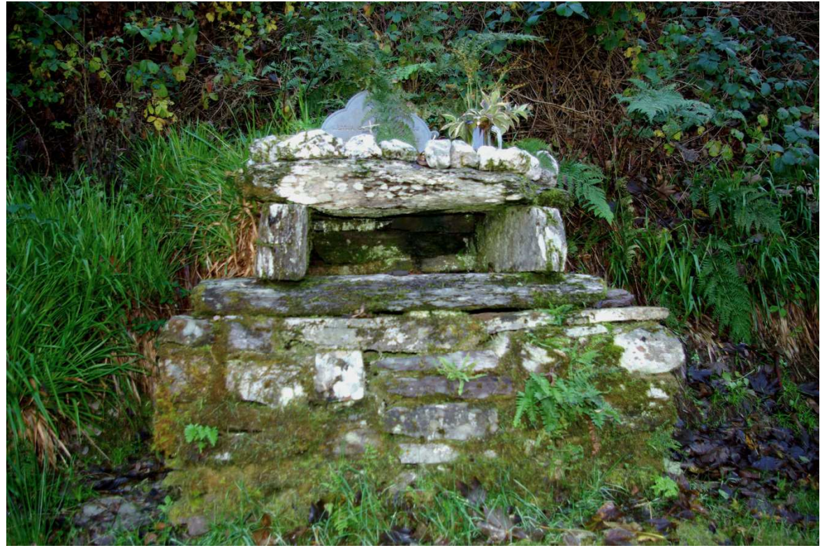
Plate 8. Curraheen Mass Rock, Inchigeelagh

Despite the availability of these buildings, Mass Rocks continued to be used in this parish well beyond these dates. A Mass Rock at Carriganeela was used by locals up to the 1950s and the Curraheen Mass Rock is believed to have been used up until the appointment of Father Holland as Parish Priest in 1816 when its use was superseded by Mass in a private cottage in the village prior to the building of the Catholic church in 1842 (Ryan 1957, 27).