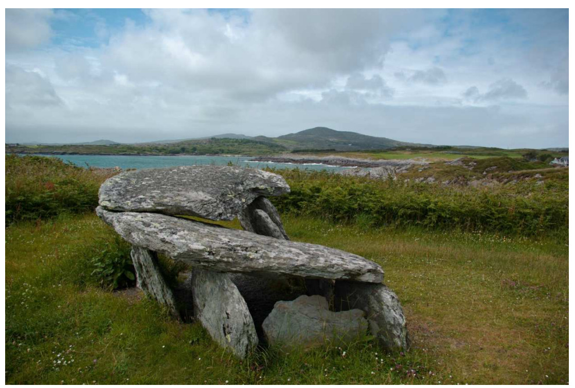
Plate 5. Toormore Mass Rock, Schull, Cork

tomb at Scrahallia, Cashel, Connemara (Cooney 1985, 134) and the Srahwee or Altoir Wedge Tomb in Clew Bay, county Mayo (Plate 6).