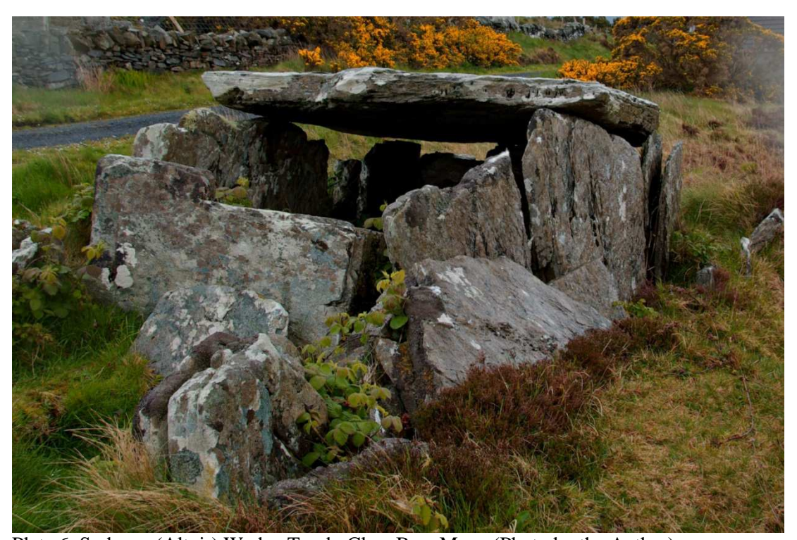
Plate 6. Srahwee (Altoir) Wedge Tomb, Clew Bay, Mayo