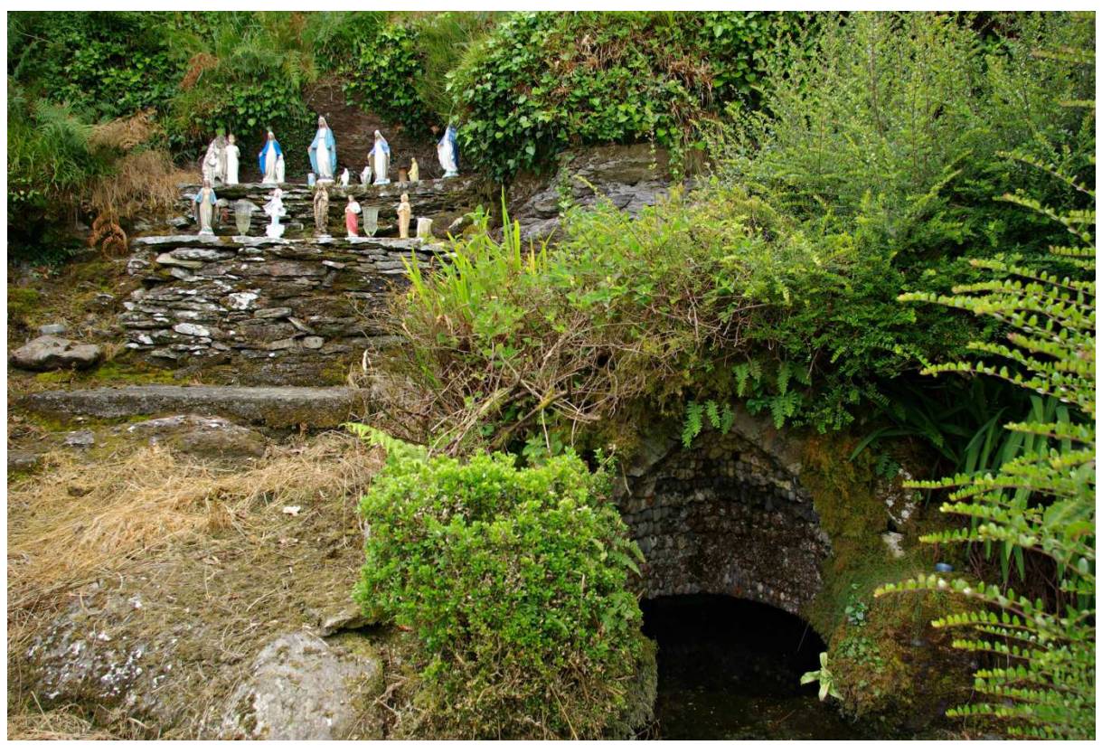
Plate 2. Beach Mass Rock in close proximity to Lady's Well, Bantry

The sacredness of stone is clearly apparent in its use as an altar and, according to Moss, stone has always been the preferred material for altar use although there is some evidence for the use of wooden altars during the later middle ages (Moss 2006, 81). The large number of Mass Rocks that utilise natural rock formations is strong evidence that sites were often chosen because of specific topographical features. At Ballyshoneen, in the diocese of Cloyne, Mass was celebrated at a rock face that resembled a human face in profile. The Mass Rock at Gortnahoughtee (Plate 3), known as Carraig an tSeipeil (Rock of the Chapel), resembles a small chapel whilst at Cúm an tSagairt (Hollow of the Priest), in Ballingeary, the Mass Rock is an unusually shaped prow-like boulder which stands in an isolated position within a natural hollow in the landscape (Plate 4).