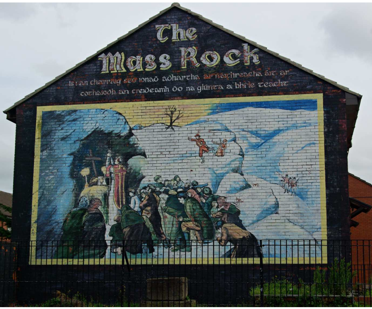
Plate 7. Mural, Ardoyne Road, Belfast

Despite such pre-conceptions, in the diocese of Cork and Ross, relatively few Mass Rock sites are found in upland mountain settings or at high elevation. The majority of sites are found within fields or pastureland or situated within wooded glens and gallery woods. Reports within the Schools' Manuscript Collection support the rich variety of locations identified during field research. One entry reveals the presence of a Mass Rock in Borlinn in a 'lonely isolated glen' (S282, 114). In Kilbrittain 'on the eastern slope' of Gleann na mbrathar or Friars Glen, another entry reveals that 'a rough table has been cut in the rock'. While this Mass Rock was on one side of the glen, between the Mass Rock and the stream was 'a green level patch where the people knelt during Mass' (S313, 306a).