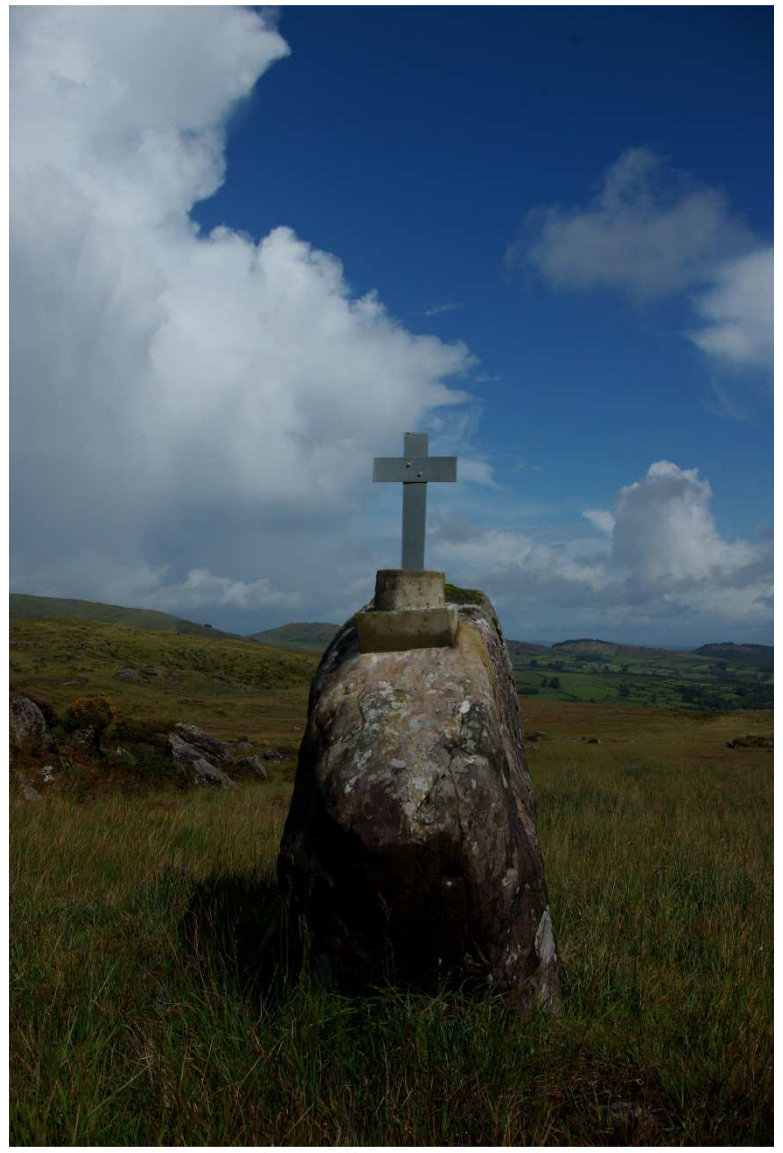
Plate 4. Cúm an tSagairt, Ballingeary

Cooney highlights the fact that some areas in Ireland had already become 'special' places in the Neolithic period and that these have remained the scene of continuing attention in archaeology, history and mythology, as people have referred back to their past (Cooney 2008, 34). Cooney's observations have specific relevance to the location of Mass Rocks sites, particularly in Cork, where archaeological monuments such as ringforts, stone circles and wedge tombs were re-used and re-interpreted during the Penal era at sites such as Cooldaniel, Derrynafinchin, Drombeg and Toormore (Plate 5). This practice is certainly not confined to the Cork area and similar examples can be found in other counties including a re-used wedge