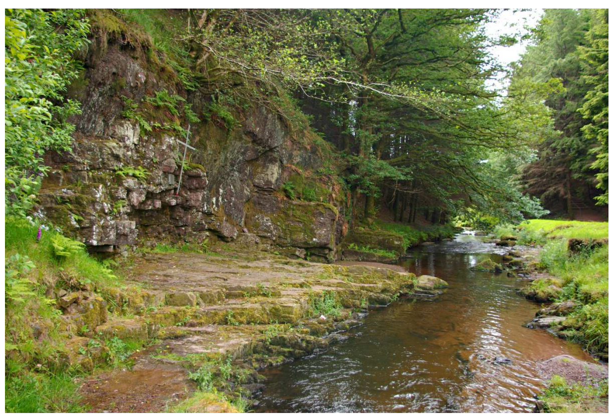
Plate 1. Glenville Mass Rock at the edge of the River Bride

Walsham (2012) identifies that, in Ireland, Holy Wells were widely regarded as locations where supernatural power was especially potent so it is not surprising that a number of sites are located beside Holy Wells. The Beach Mass Rock, which is found beside Lady's Well in Bantry, is one such site (Plate 2). Other Mass Rocks are situated close to lakes such as those at Coornahahilly and Curraheen in Inchigeelagh, whilst some, such as Mishells, are found in close proximity to fords. Many ancient Celtic battles were staged at fords because they were believed to be places of crossing and transformation (Brennaman & Brenneman 1995, 22).