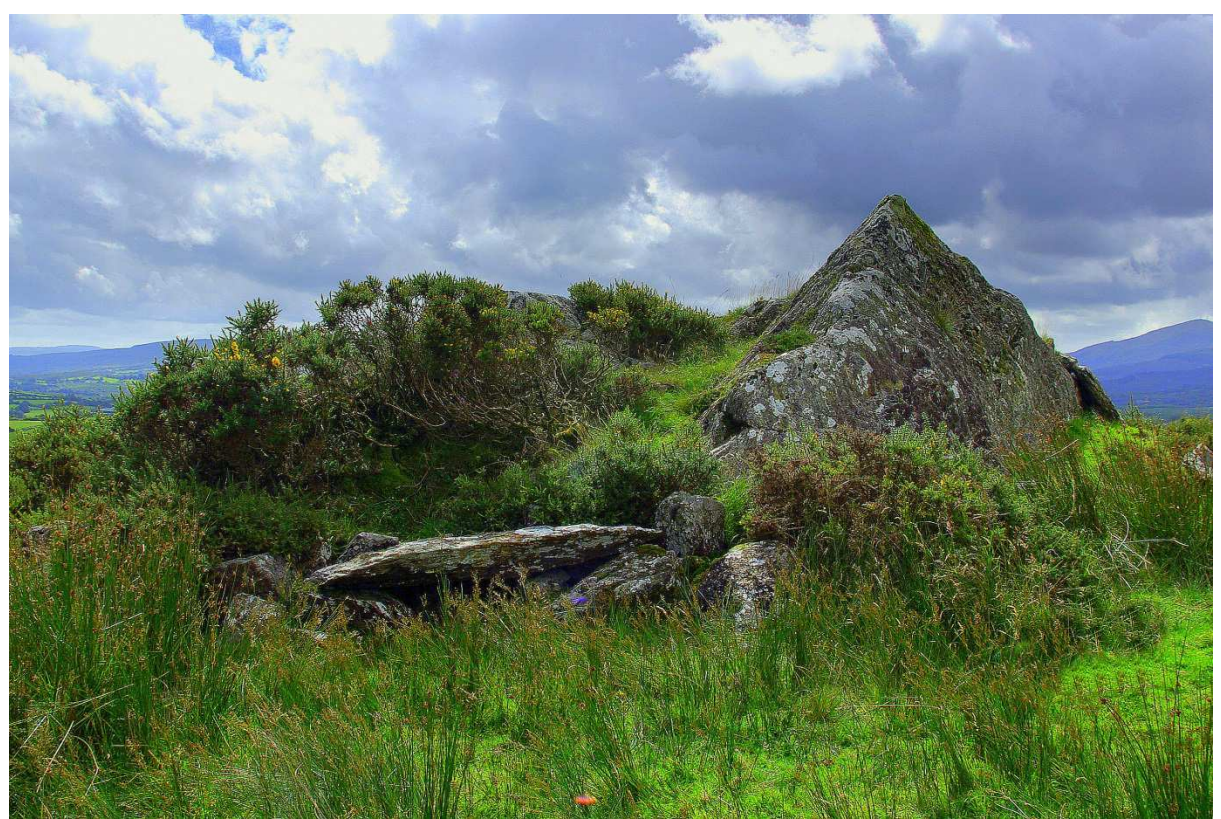
Plate 3. Gortnahoughtee Mass Rock also known as Carraig an tSeipeil, Inchigeelagh