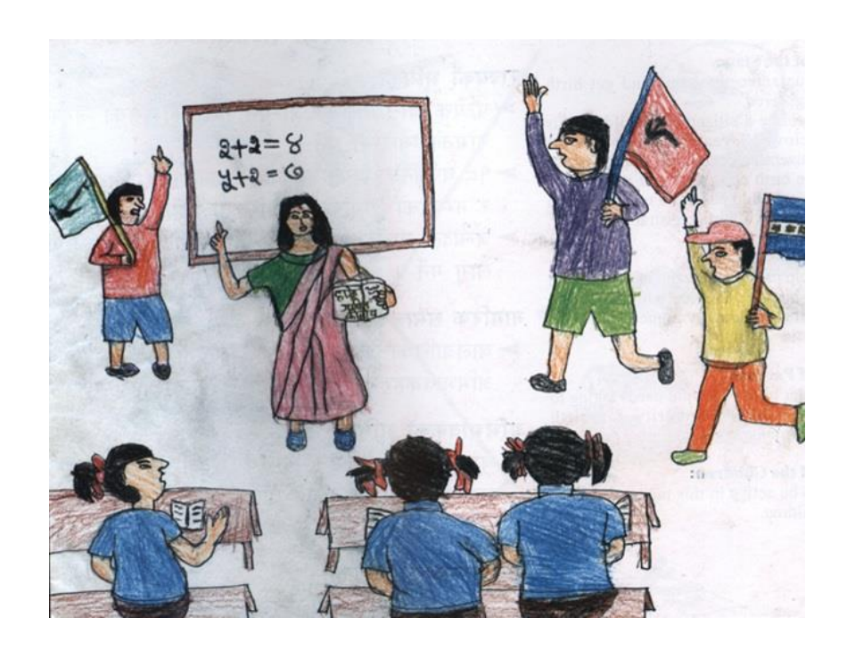
CN (2008) Image depicting how children are misused in political conflict, by both the army and the police force as well as political parties.

However, the Maoists gained popular support by focussing on local concerns such as ensuring teachers regularly attend class and do not drink alcohol and that all pupils are treated equally regardless of caste or gender. In the main, these moves to make the education system in Nepal less elitist and more equitable were welcomed (IRIN, 2005; Save the Children, 2005). In some Maoist controlled areas, increased attendance of children in school was reported and also an increase in the number of taught days. One respondent reported that in their school: