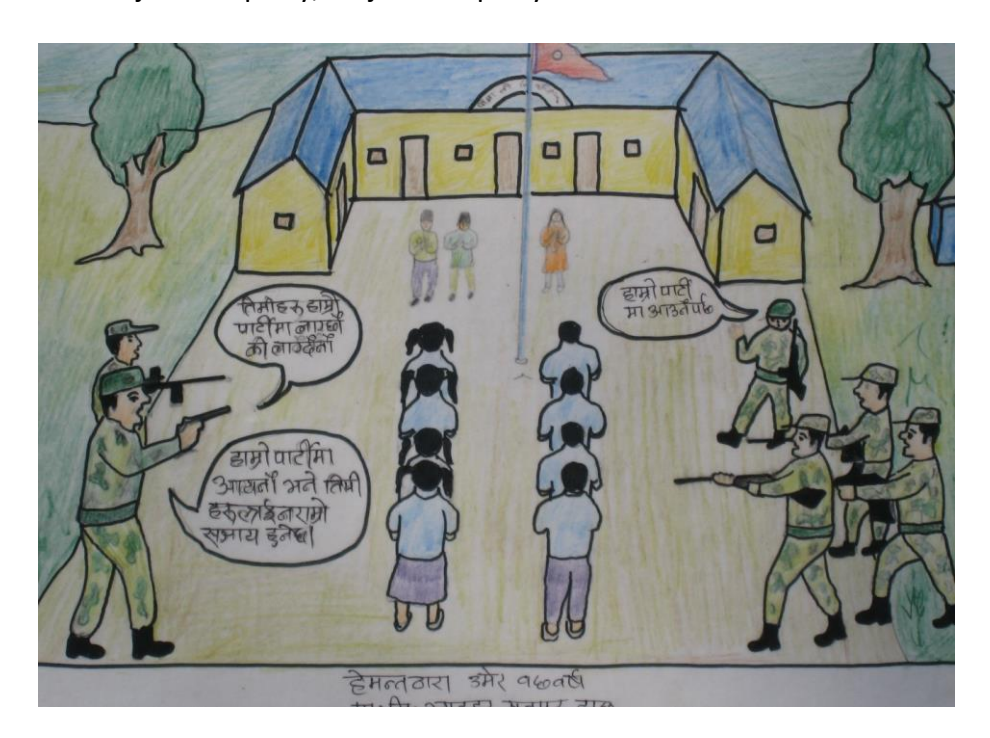
GAN (2010) Image from workshop with Children's Club

The pressure felt by children at being trapped between all parties is depicted in the diagram below, where the text reads "join our party, no join our party ...."