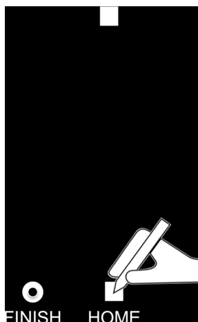
Figure 1. Forward reach and point task. In the action execution task the participants moved the stylus accurately and rapidly from the HOME button to the target, back to HOME and then to FINISH. doi:10.1371/journal.pone.0067761.g001

To ensure a maximally homogeneous task across all participants and conditions the following specific instructions were explained and repeated at the start of each block of trials. In the AE condition, participants were asked to move the stylus as accurately and as quickly as possible. In the GMI and UGMI conditions, participants were instructed to image the task from a first person egocentric visual orientation and to employ both visual and kinaesthetic imagery modalities. The task was to be executed in