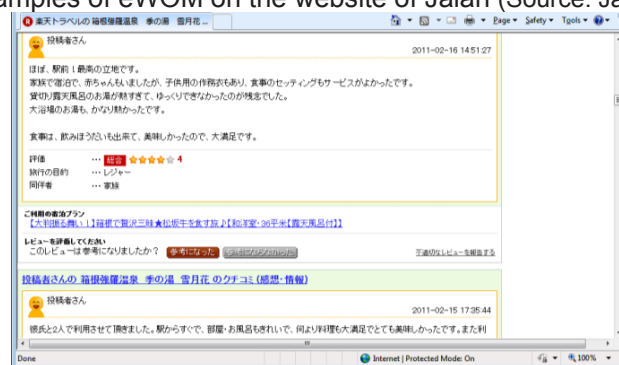
Figure 5. Examples of eWOM on the website of Rakuten Travel