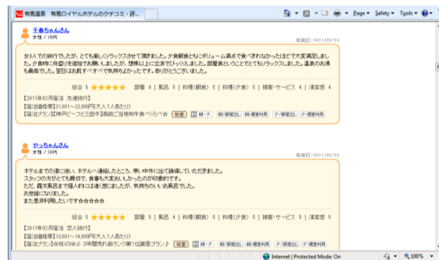
Figure 4. Examples of eWOM on the website of Jalan

as the data explored in the research. Compared to online blogs and social networking sites, eWOM available at the websites of Jalan and Rakuten Travel are made mainly to exchange and share the guests' expectation for and experience at ryokan . In addition, eWOM available at their websites follows a specific format. That is why adopting eWOM as the data investigated would not cause any serious problems in the data collection and analysis. eWOM is also desirable in terms of anonymity since people can upload their eWOM with their username. For the above-mentioned reasons, eWOM available on the websites of Jalan (See Fig. 4) and Rakuten Travel (See Fig. 5) were chosen as the most appropriate data examined in the research. Japanese words which are equivalent to "website" and "eWOM" are used to identify the data related to this research. The analytical methods adopted are interpretation of eWOM and coding. The details are explained in Table 2.