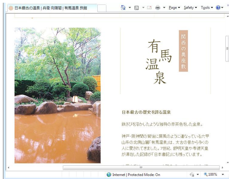
Figure 3. Hot-spring facilities featured on the website of Hyogo Koyokaku in Hyogo Prefecture