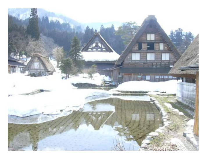
Fig. 1. Gassho-style houses in WHS Ogimachi

Kumi is the self-governing community unit and yui is the traditional custom of mutual help based on the exchange of labour and operated by the members of the kumi. These customs show that Shirakawa-mura still has a certain level of community spirit which has seriously declined or been lost in most Japanese cities and towns. Kumi and yui have also supported the conservation works of gassho-style houses. WHS Ogimachi is important as a living example of a historic village because of its historic buildings and landscape, and the continued existence of traditional life in all forms (Agency for Cultural Affairs, 1994). The Preservation Plan for the Shirakawa-mura Ogimachi Important Preservation District for Groups of Historic Buildings was enacted in 1976 (Shirakawa-mura Ogimachi, 1994). The buildings and structures forming WHS Ogimachi are described in the Preservation Plan. The proper management of these buildings is the obligation of the owners of the buildings, and alterations to the existing state are strictly controlled. Canals, trees, and irrigated rice fields are also important elements of the landscape of WHS Ogimachi, and these elements are listed as environmental features in the Preservation Plan (Agency for Cultural Affairs, 1994). Regarding tourism, a great increase in the number of tourists was confirmed after WHS