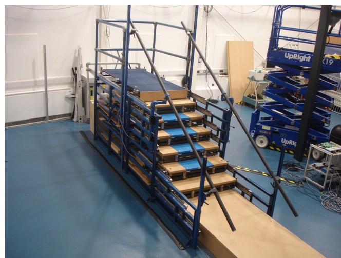
Fig. 1. Experimental seven-step staircase with four Kistler force plates built into steps 2–5. A moveable dolly mounted on the ceiling above the staircase allowed a safety harness to be used whilst participants walked along the staircase.

Maximum effort concentric (muscle shortening) and eccentric (muscle lengthening) ankle plantarflexion and knee extension moments were measured using an isokinetic dynamometer (Cybex Norm, USA) as previously described and performed by the same cohort [27]. Due to patient availability, maximum isokinetic joint moment were recorded for fifty-nine (CTRL: n = 18 , DM: n = 27 and DPN: n = 14 ) of the original ninety-four participants. These muscle groups were chosen as the predominant muscle groups active