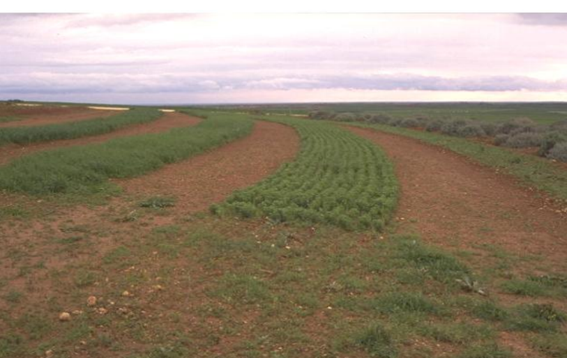
Figure 2 Strip cropping system - planted by barley

Technical assistance for laying out a strip cropping system was needed. The farm is divided into strips along the contour. An upstream strip was used as a catchment, while a downstream strip supports crops. Attention has been paid such that the downstream strip's width did not exceed 1-3 m, while the catchment width was determined in accordance with the amount of runoff water required (see Figure 2). Runoff strip-cropping was fully mechanized needing only a relatively low input of labour.