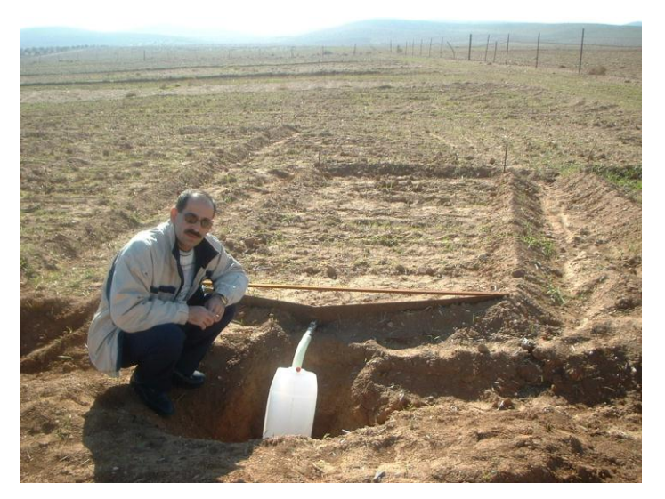
Figure 1 Frame methods for collection of runoff and sediments

A representative sample was taken at the end of each replication from the collection container and measured. Samples were shacked and 100 ml of each sample was dried in the oven at 100°C for 24 hours and weighed to determine the average sediment yield. Both fields were planted in November 2004 with barley seed (ACSAD cultivar) with 100 kg of seeds per hectare, and Di-Amino Phosphate (DAP) fertilizer was used at a rate of 100 kg per hectare. A planting machine was used to sow the seed sin rows which were spaced 20 cm apart from each other. Three treatments were used: 1:1, 1:2, and 1:3 metre ratios of cultivated to catchment area, which each had a strip width of 4 metres. Soil profile description is given in Table 2.